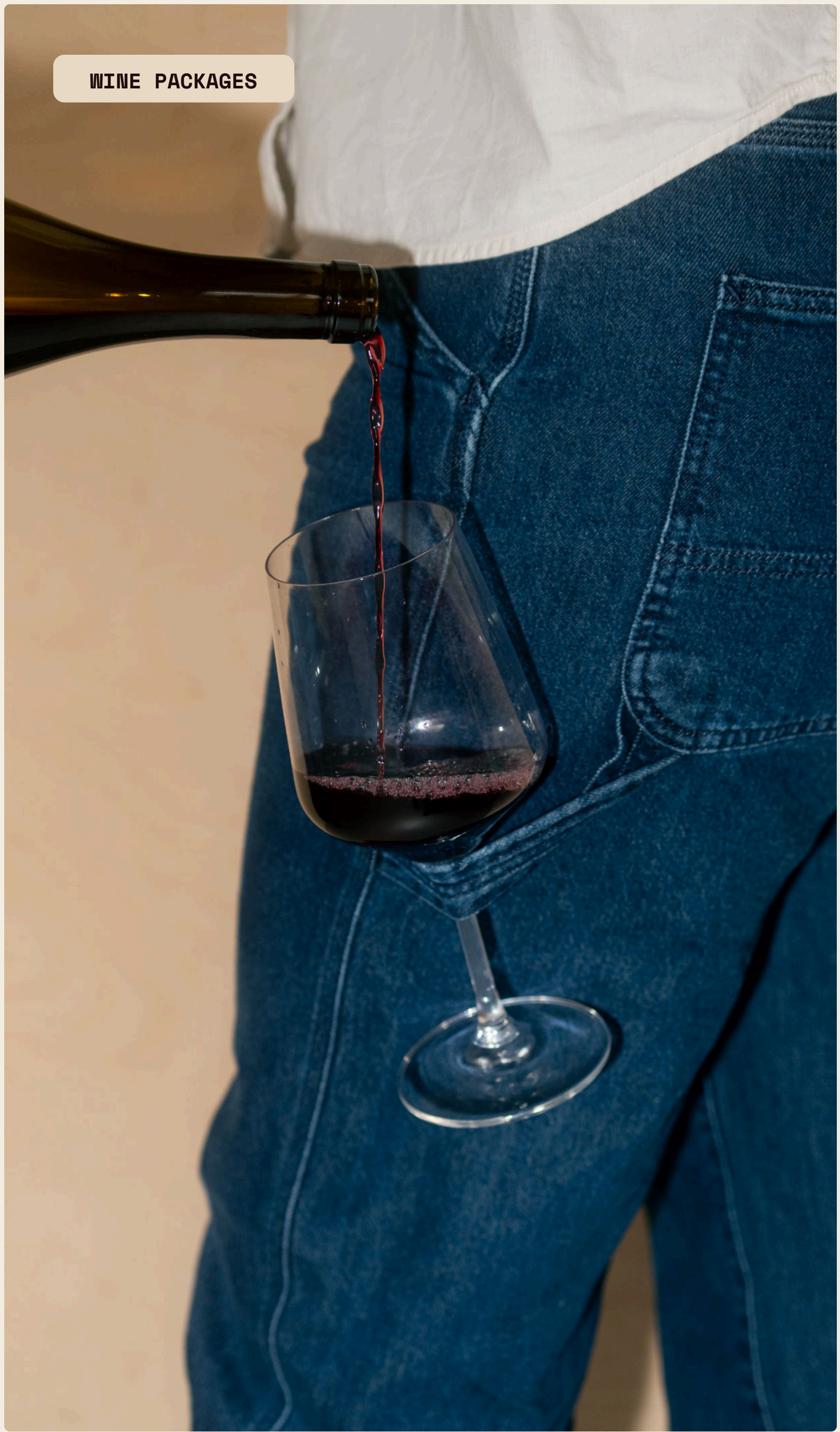
A Focus on Natural Wines Celebrate thoughtfully sourced, natural wines that pair perfectly with our menu and elevate any gathering. Our curated selection highlights vibrant flavours, low-intervention craftsmanship, and bottles meant to be shared.