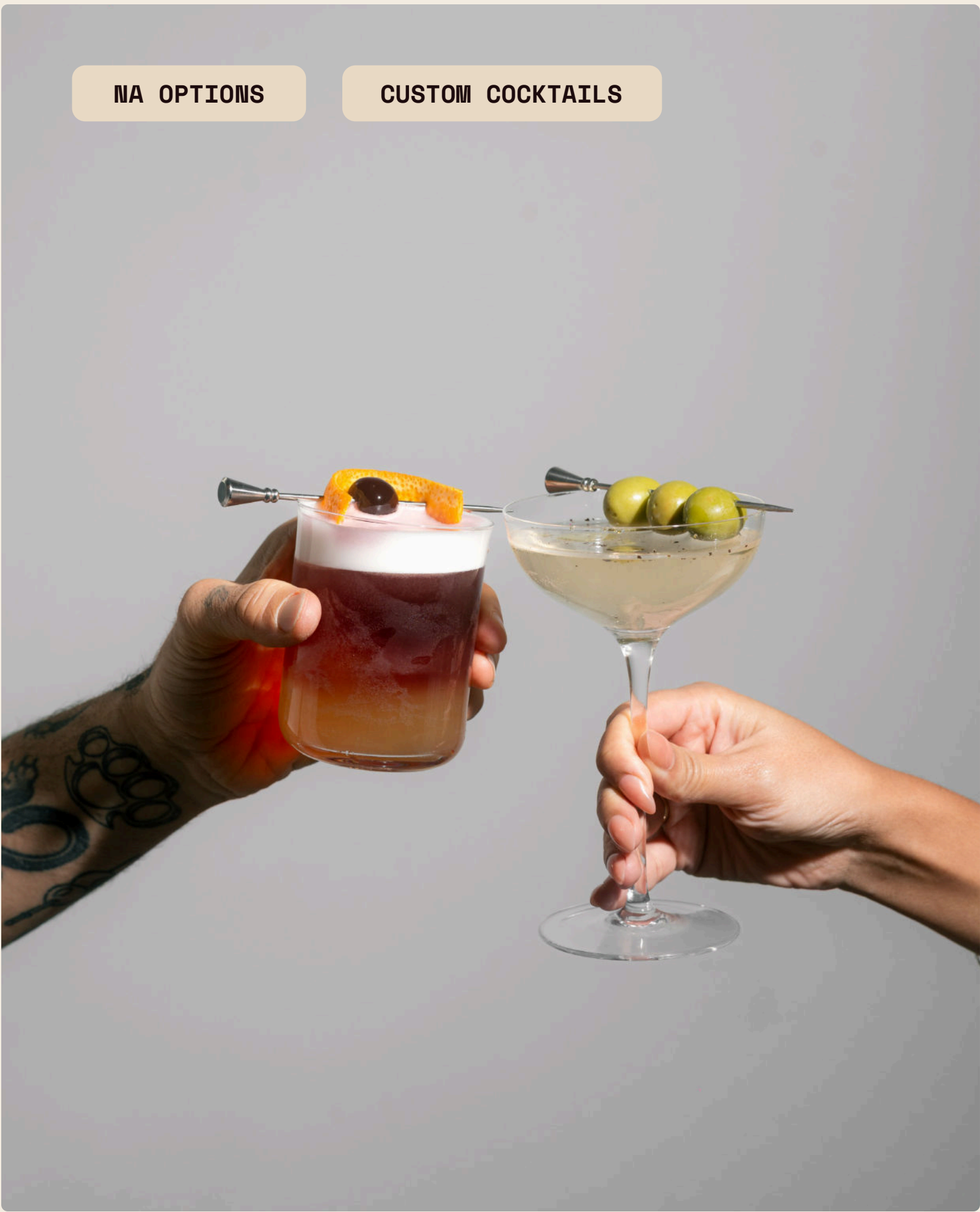
Cocktail Program Original cocktails, reimagined classics, natural wines, craft beer, and zero-proof options — curated for your crowd.