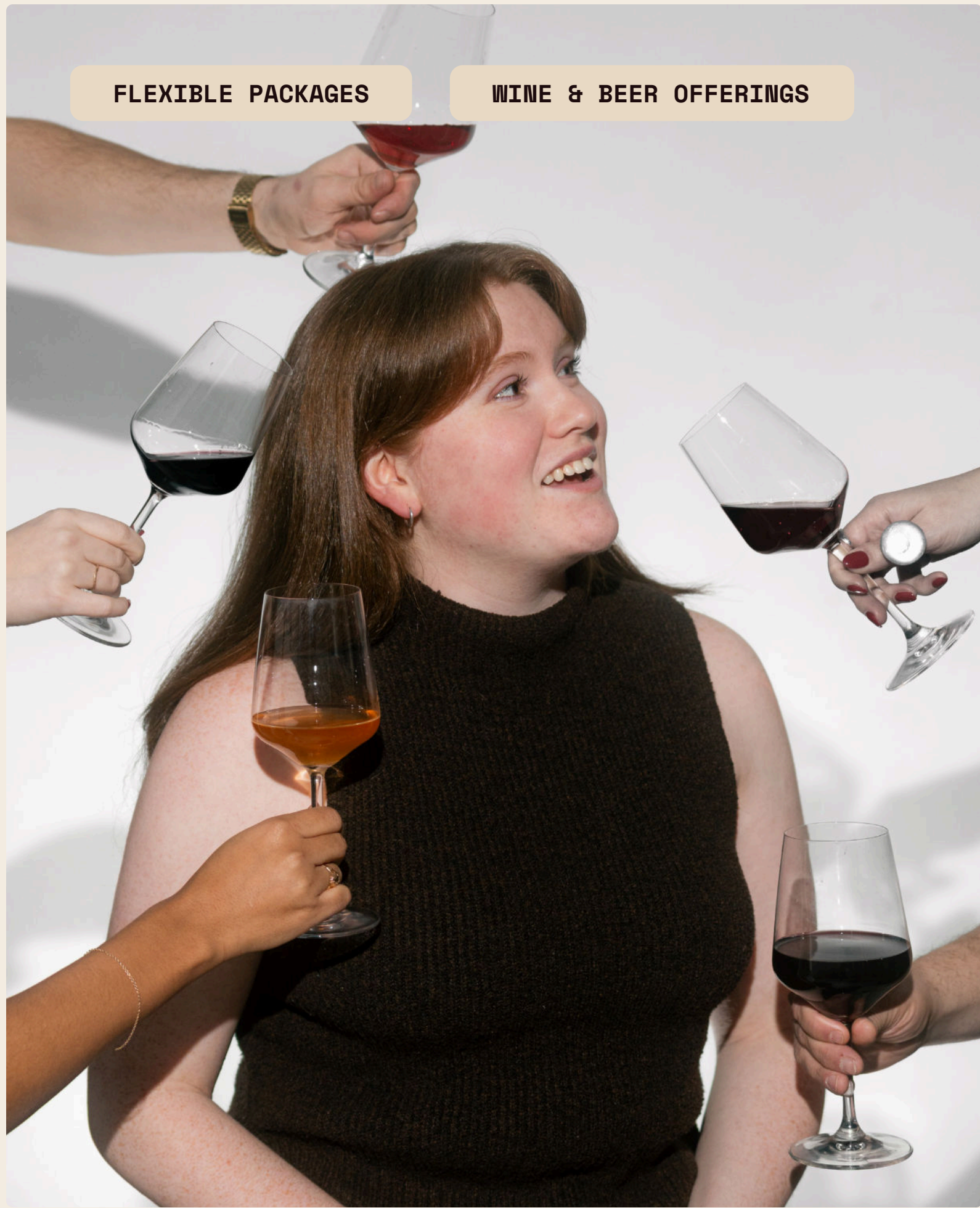
Beverage Packages Choose a consumption-based bar or a hosted package, with options to scale for budget and style.