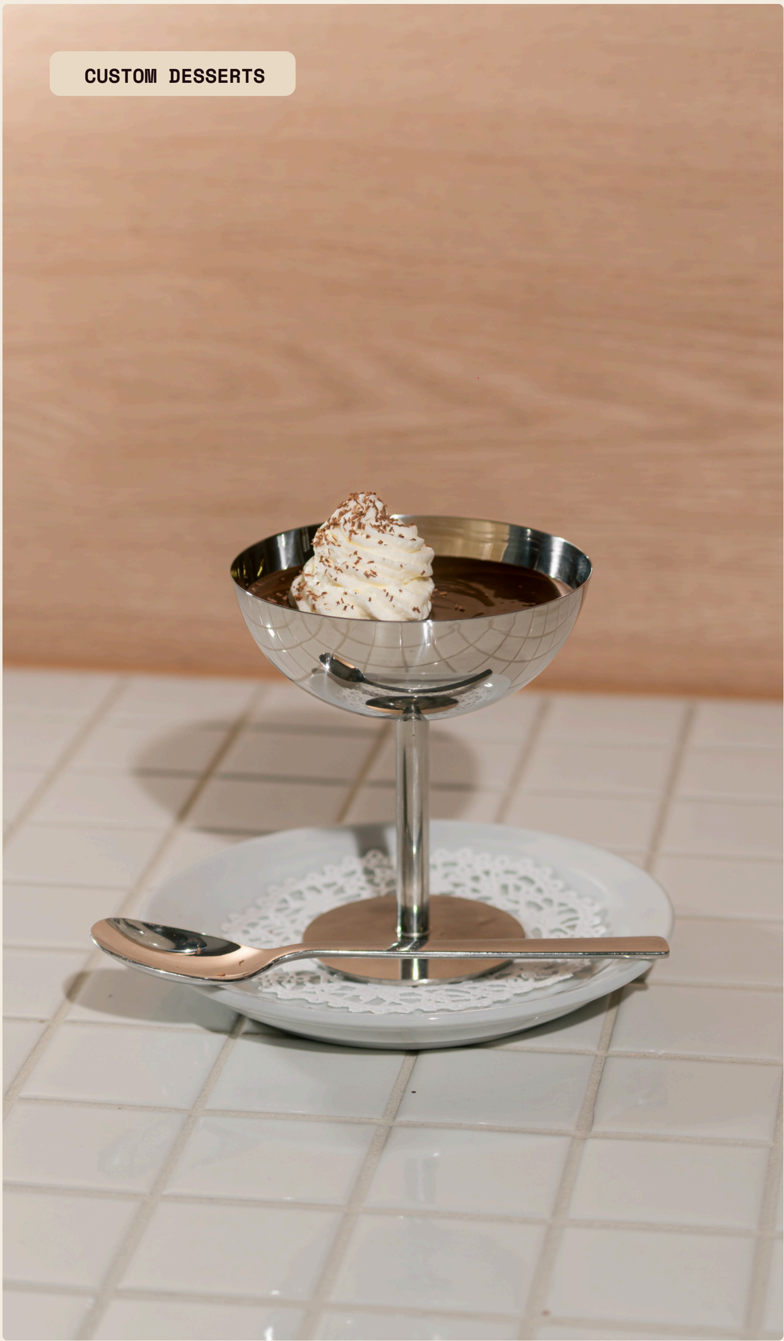
Sweet and Simple Desserts End your event on a high note with desserts that are light, modern, and effortlessly satisfying. Each treat is crafted to complement your meal without overwhelming it. Sweet, simple, and memorable.