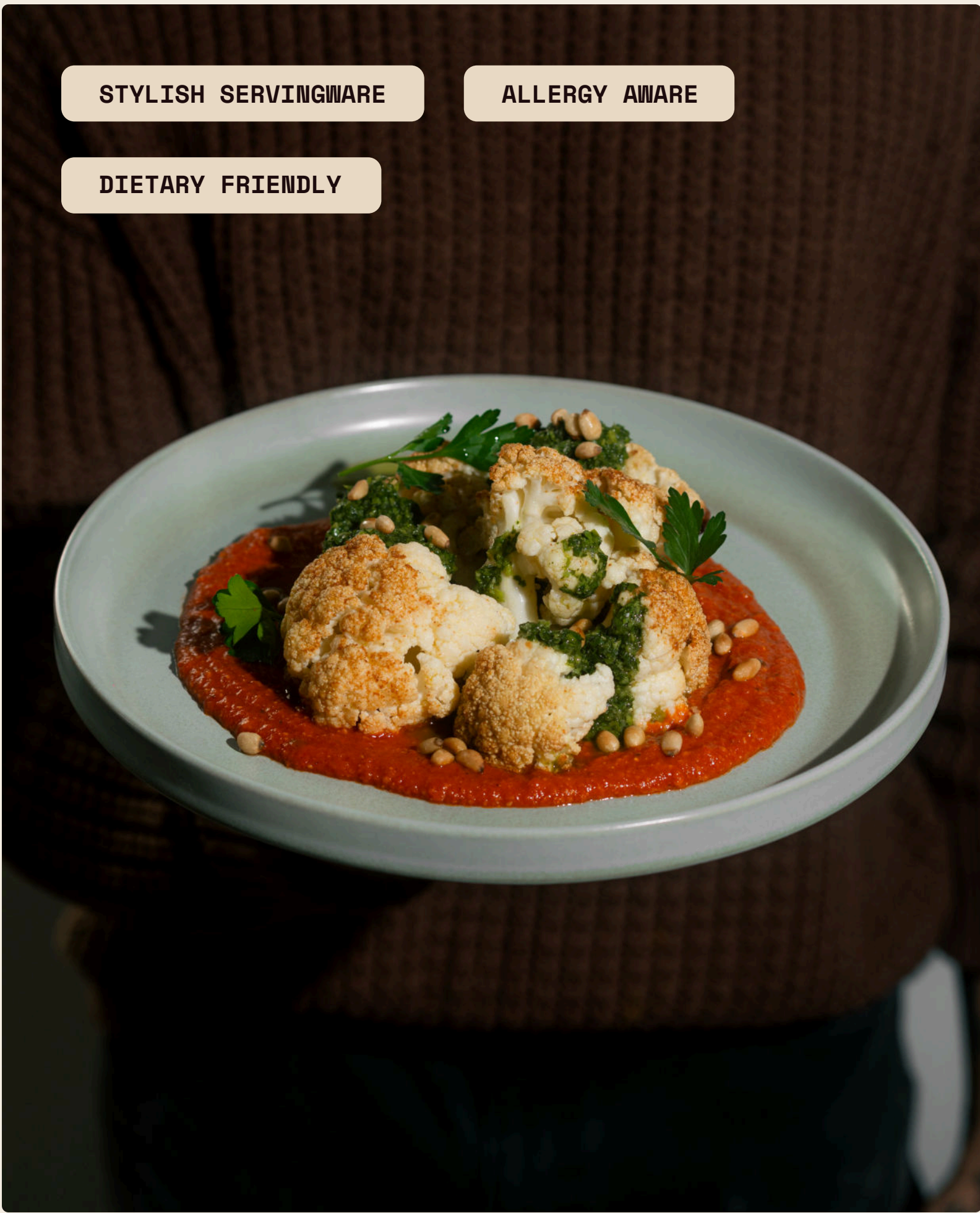
Custom Menus Designed around your tastes, your guests, and the season. From family-style dining to cocktail bites, our menus are anything but standard.

Food and drink that surprise, delight, and keep the good times flowing. Everything from high-end wines to unpretentious beers, the choice is yours.