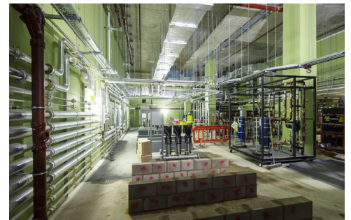
Basement fit-out progress

The scaffolding around the Riding School is currently being removed following completion of the roof restoration works, with internal works scheduled to begin in the New Year.