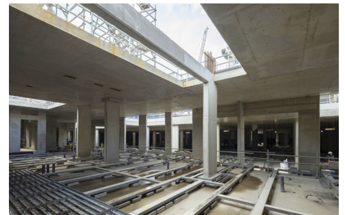
Basement areas under construction