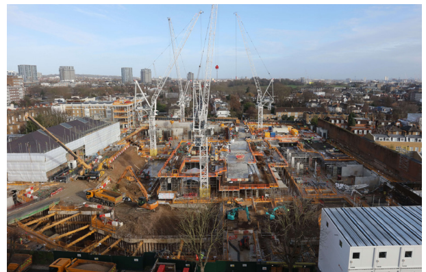
Construction progress as of January 2025

Thank you for your continued understanding and support. We wish you a Merry Christmas and a happy New Year.