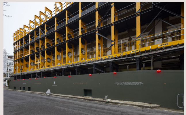
Façade retention system, Building 9, Queen's Terrace, January 2026.

Works are set to begin shortly on the removal of the temporary façade retention system at Queen's Terrace. This follows the successful restoration of the historic façade, which has now been fully repaired and permanently secured to the new Building 9 structure behind.