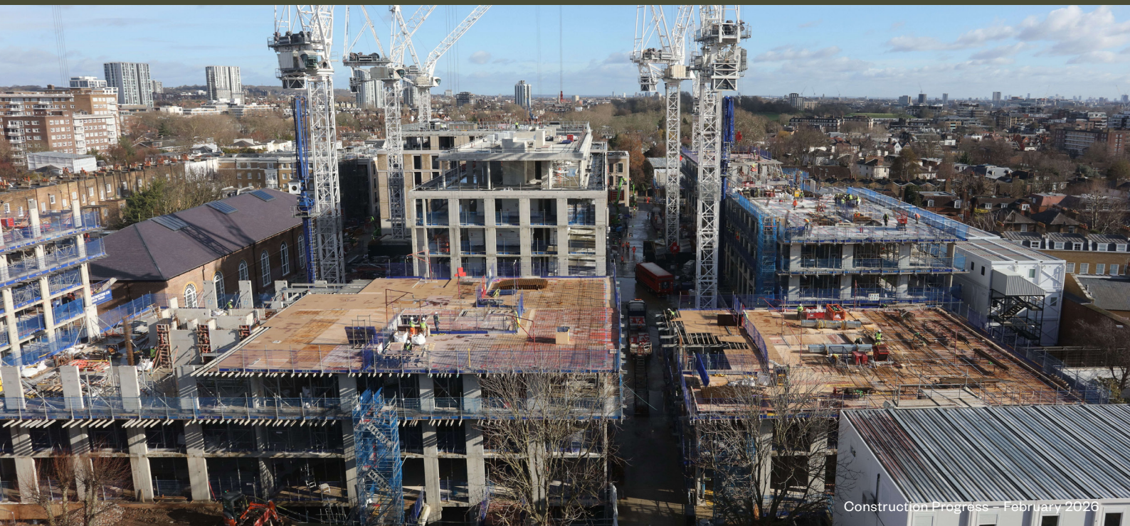
Construction Progress – February 2026