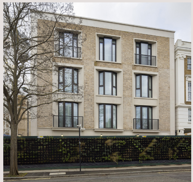
Building 5, March 2026

Works on Buildings 5 and 7 are now progressing through the internal fit-out stage. This phase of construction focuses on completing the interior of the building now that the main structural elements are largely in place. Over the coming months, teams will be installing internal walls and partitions, ceilings, doors and flooring throughout the buildings. These works will gradually transform the structural shells of Building 5 and 7 into fully functional homes.