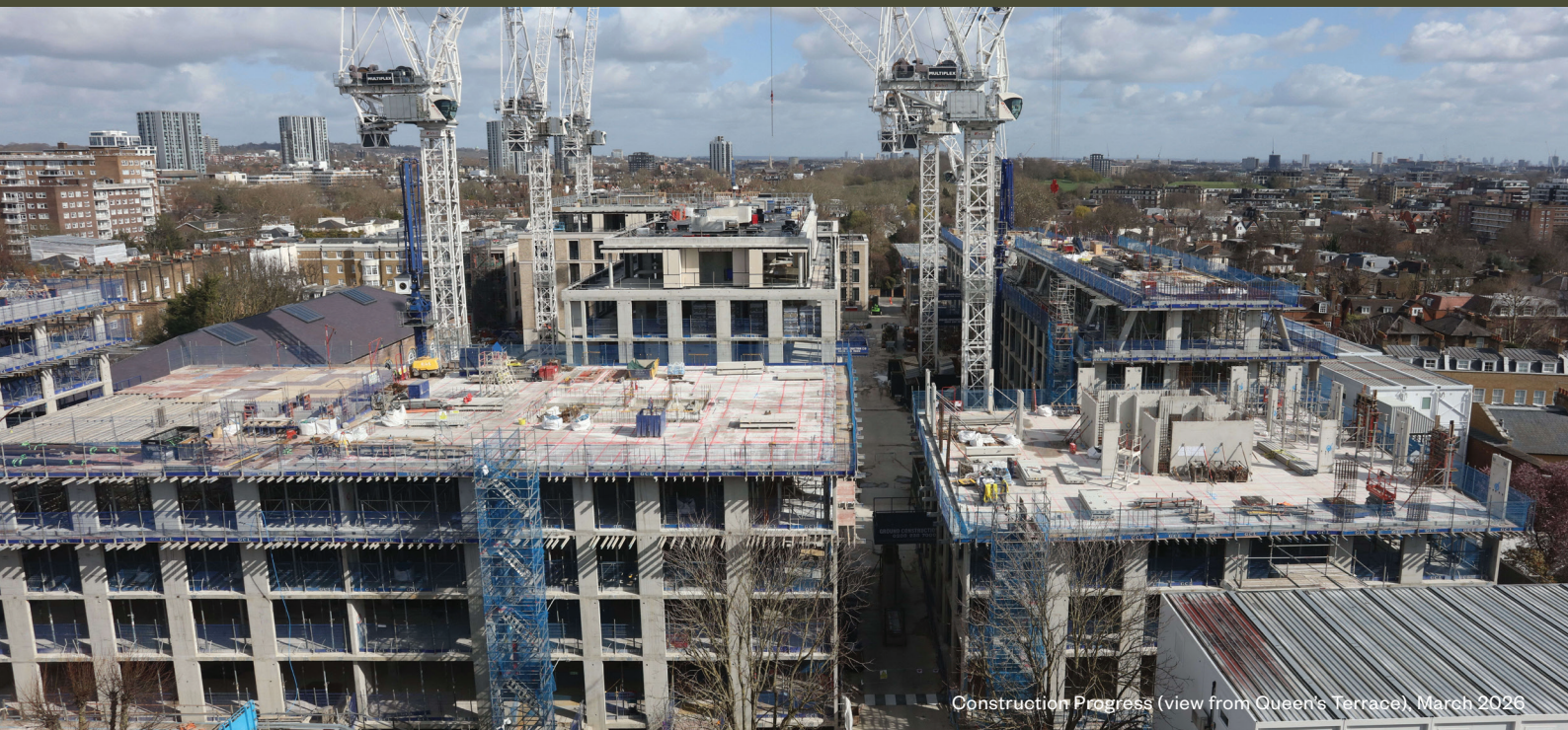
Construction Progress (view from Queen's Terrace), March 2026