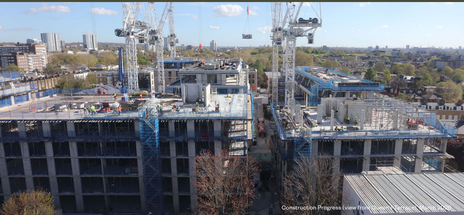
Construction Progress (view from Queen's Terrace) March 2026