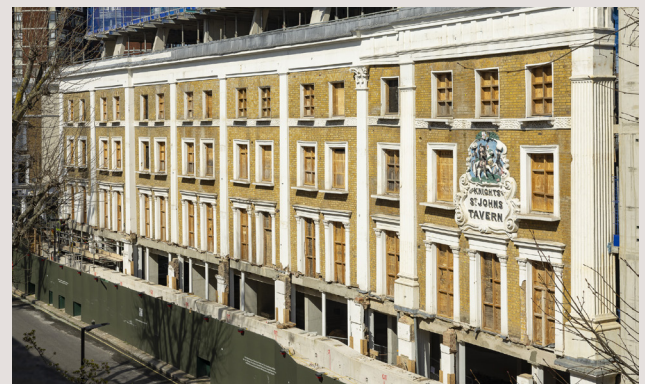
Building 9 façade following removal of retaining supports, including the historic St. John's Tavern sign.

This month marks an important milestone for Building 9 on Queen's Terrace with the removal of the steel façade retention structure, which has been in place since mid-2024. This temporary framework has supported the historic frontages along Queen's Terrace and Queen's Grove while construction progressed behind them.