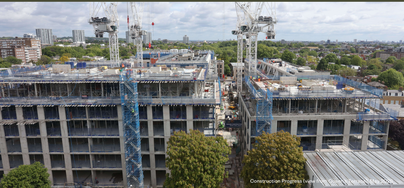
Construction Progress (view from Queen's Terrace), May 2026