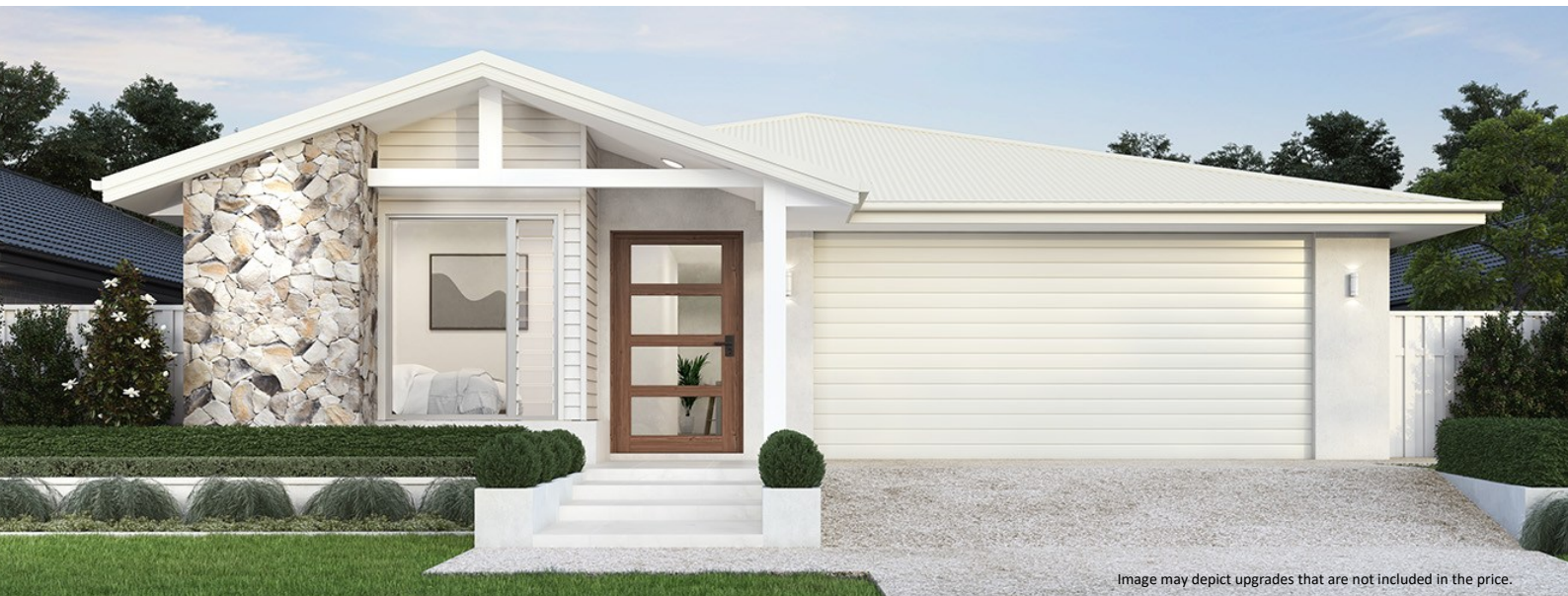
Image may depict upgrades that are not included in the price.

Floor Area: 203.58 sq m | Block Size: 375 sq m Address: Lot 716 Janewindi Street, Kings Forest