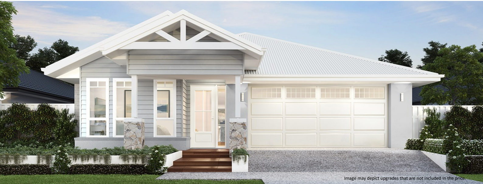
Image may depict upgrades that are not included in the price.

Floor Area: 256.78 sq m | Block Size: 540 sq m Address: Lot 718 Janewindi Street, Kings Forest