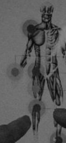
Key Areas of Tension in the Anterior Chain

we examine and understand within the anterior chain, the shoulder alignment, hip flexibility and functionality in the anterior chain. This is key to understanding the anterior chain, as it is the primary source of power and stability, and is the primary source of power and stability. A combination of dynamic, developmental and static exercises, focusing on strengthening the core, glutes, and hips, are essential for knee stability.