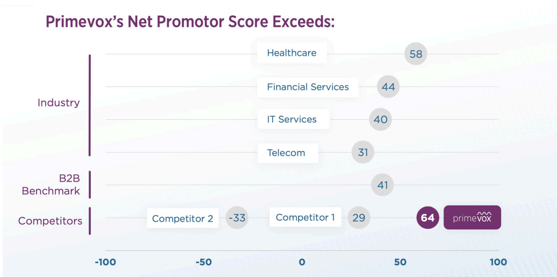
Figure 3. Primevox's Net Promoter Score compared with various industries, Business-to-Business (B2B) benchmarks, and two leading competitors.

At Primevox we traditionally perform training remotely. Primevox can host a webinar to educate the administration and employees on using the Primevox system. A separate webinar can be hosted specifically for administrators. On-site assistance for installation and training can be provided by our local IT partners.