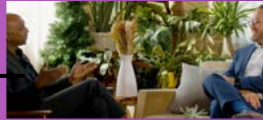
● Community Health Media (Pharma/health content engine)