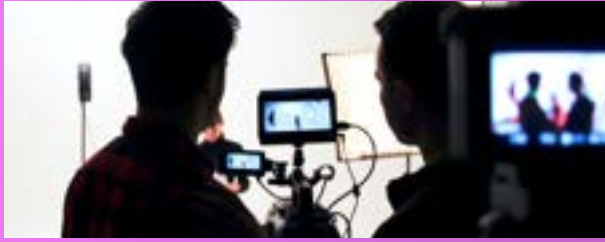
● Legacy Sessions (Premium podcast studio)