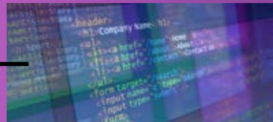
● Investments in AI content tools and event tech