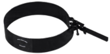
PLATE ALIGNER UA-1000/UA-1000C