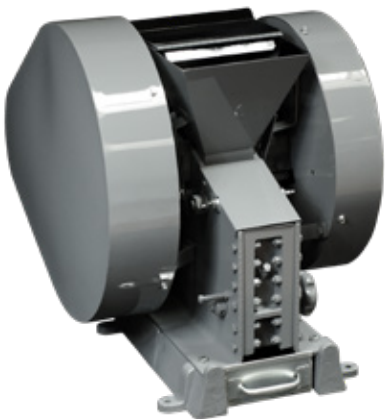
WD CHIPMUNK JAW CRUSHER (Shown with Safety Guards & Feed Hopper)

The Bico Chipmunk Jaw Crusher offers effective reduction of friable material, ore, mineral and chemical samples.