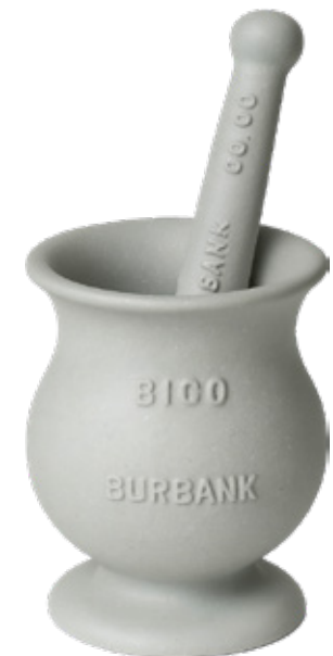
High Form Mortar & Pestle ( 1 Quart)