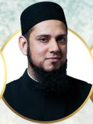
MUFTI AASIM RASHID