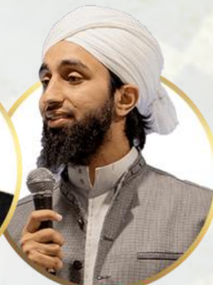
MUFTI ABDUL WAHAB WAHEED