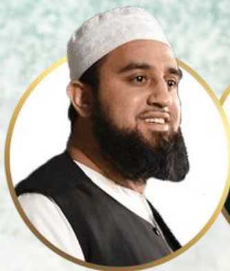
SHAYKH ABDULLAH WAHEED