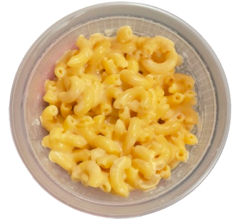
Macaroni & Cheese