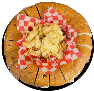
Deli Sandwich Ring