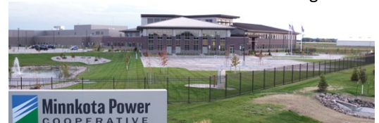
Minnkota Power COOPERATIVE