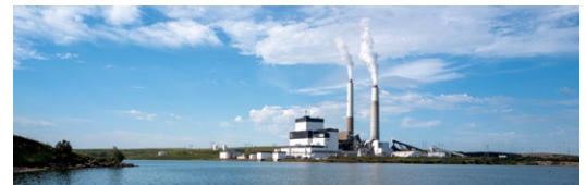
Milton R. Young Station