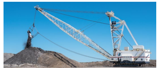
BNI Coal mine

Return to RLEC, P.O. Box 430, Red Lake Falls, MN 56750, along with your check. RLEC will contact you later with details. Your check or deposit will be returned if the tour should be canceled for some reason. If it becomes necessary for you to cancel out on the trip, it is required that you notify RLEC at least 48 hours before departure to be eligible for a refund. Registration for the trip is on a first-come, first-served basis with a limited number of openings. If you have previously taken the trip, you will be put on a space availability standby.