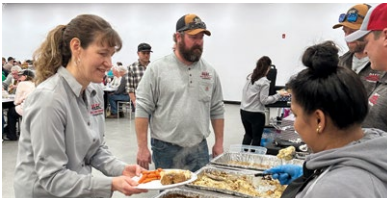
Meeting attendees enjoyed a meal catered by the Legacy Event Center.