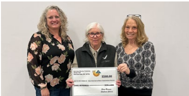
West Polk Soil & Water Conservation District receives Operation Round Up funds.