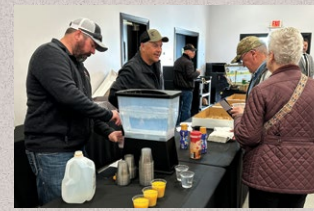
Meeting attendees enjoyed a meal catered by the Legacy Event Center.