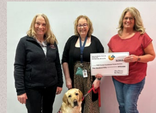
Polk County Coordinated Victim Services receives Operation Round Up funds.