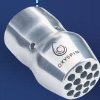
AQUA AID TASTE PLUS