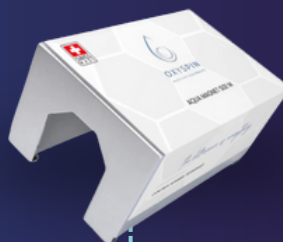
AQUA AID MAGNET