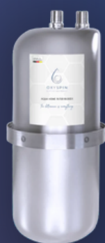
AQUA AID FILTER