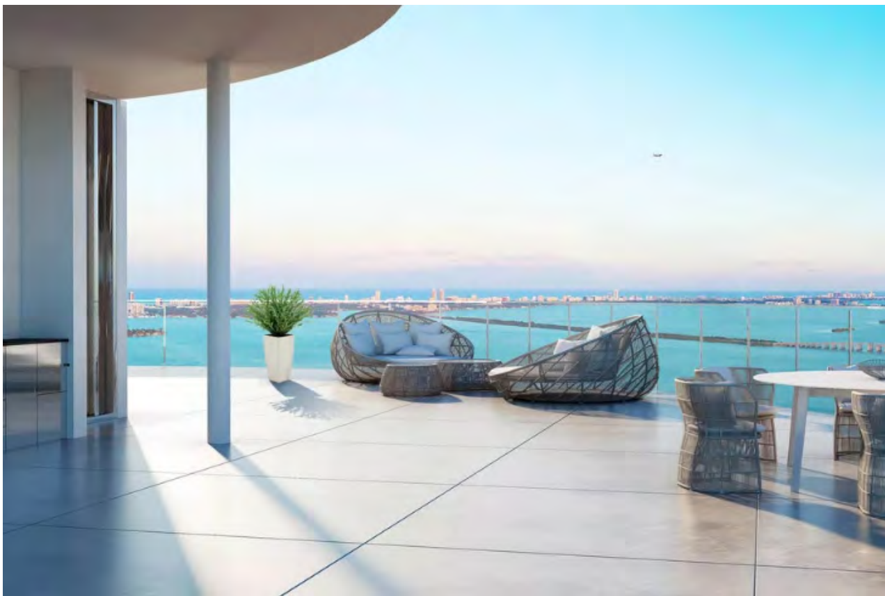
A rendering of Giancarlo Stanton's penthouse terrace at Aria on the Bay