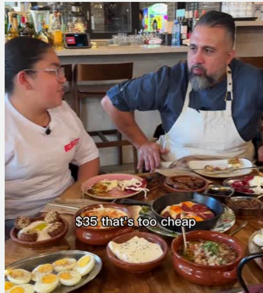
$35 ALL YOU CAN EAT 1.1M VIEWS, 42K SHARES, 9.8K SAVED

As an agency, this is always an amazing feeling to see your work bringing a restaurants success.