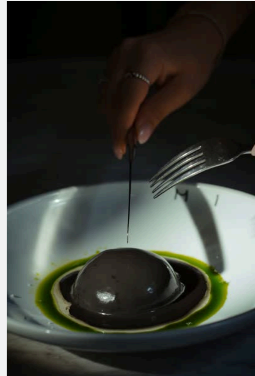
MISC PARRAMATTA THE NEW BLACK BURRATA