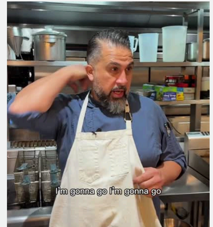
WHEN THE BOSS IS GONE 40.3K VIEWS, 343 SHARED, 400 SAVED