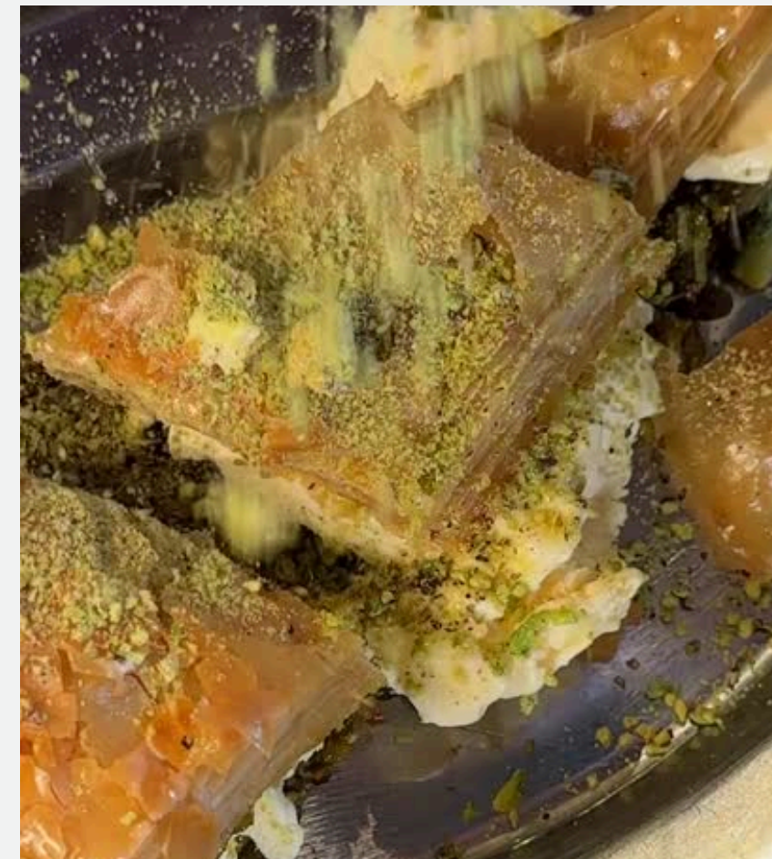
LEBANESE VIBES IN MARRICKVILLE 233K VIEWS, 5.7K SHARES, 6K SAVED