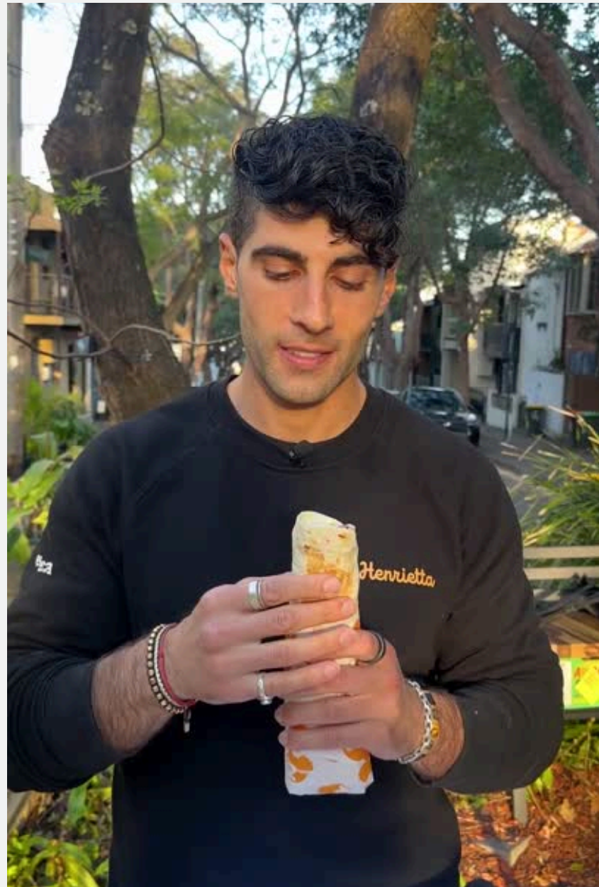
HENRIETTA FALAFELS DONE RIGHT

We have added 4 videos to show you why we get approached to create. Our effortless style leaves people continually coming back and rewatching our videos. They're unsure why they like it so much, but we know. We tap into your body to visually immerse your senses. It leaves you wanting more and more!