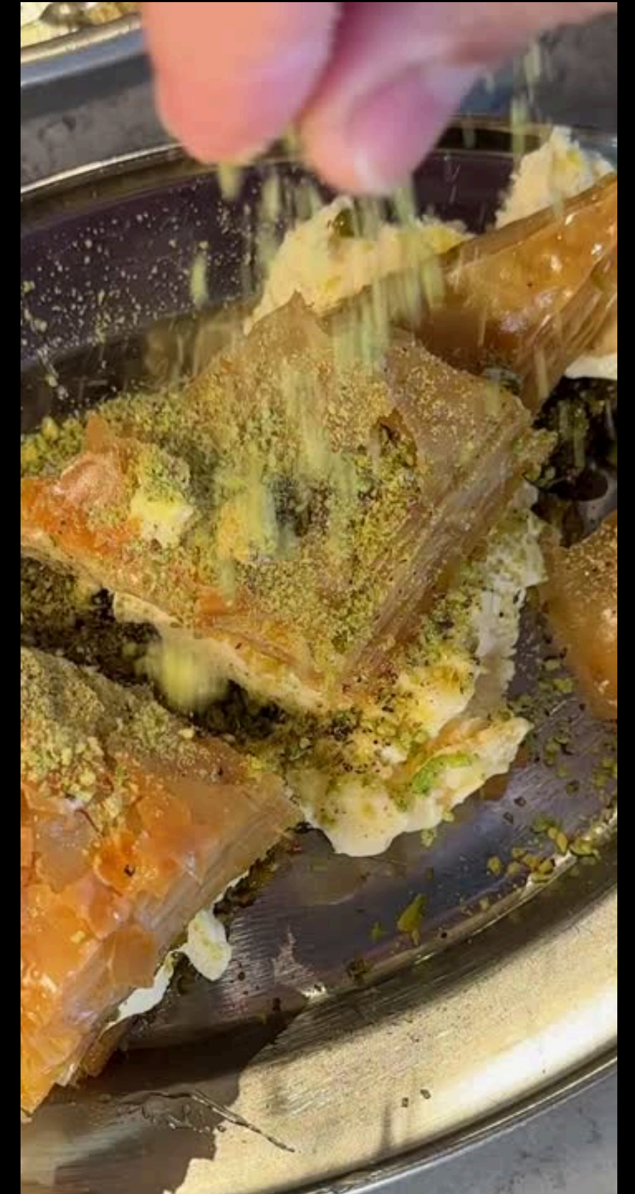
LEBANESE VIBES IN MARRICKVILLE 233K VIEWS, 5.7K SHARES, 6K SAVED