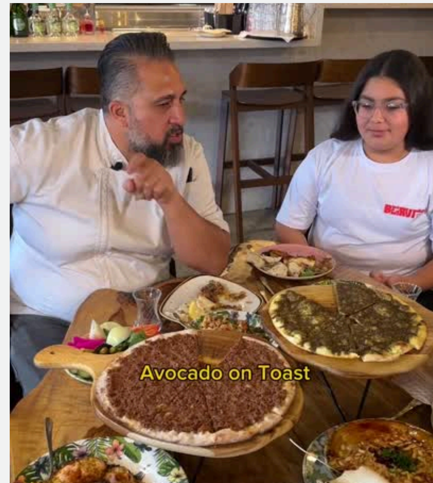
LEBANESE BREAKFAST 540K VIEWS, 12K SHARES, 7.9K SAVED