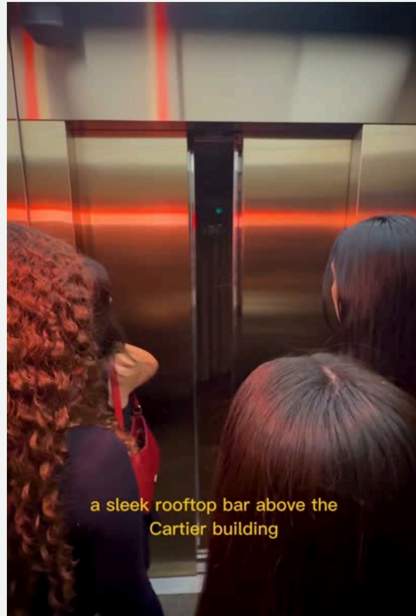
JOJI A GIRLS NIGHT AT JOJI