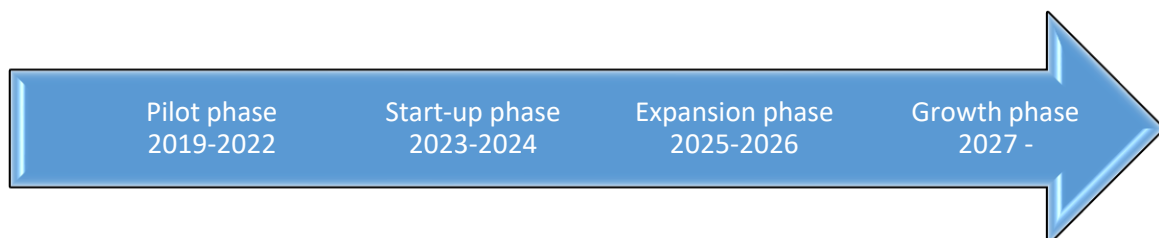
Figure 1. Main phases of the roadmap

The main phases and thus the major milestones in the roadmap are shown in Figure 1.