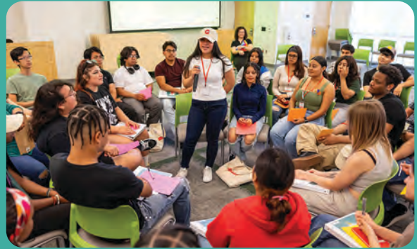
RTS Scholars debrief the Camp Ready weekend with each other on the last day.

“At Camp Ready, it was my pleasure to sit amongst a panel of powerhouse thought leaders to discuss how former foster youth can use the power of storytelling in their communication – be it interviewing for a job or when networking in general. Authenticity rose to the top. Being true to yourself, who you are, your values, and not being afraid to ask for help. It was such an inspiring afternoon. I am grateful to my RTS family for having me.”