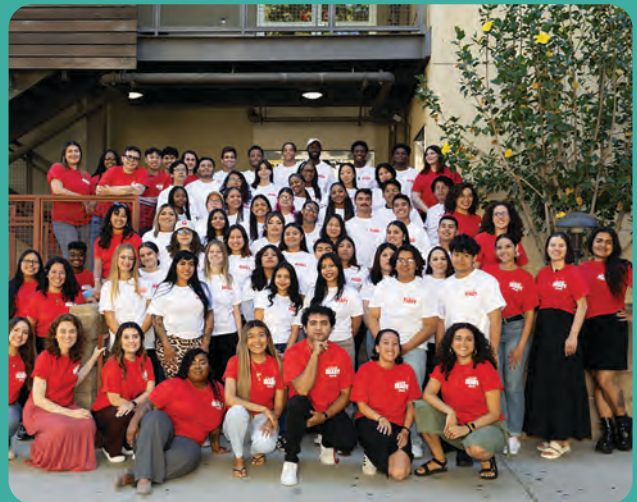
This year's Camp Ready Scholars, Camp Counselors, and RTS staff.