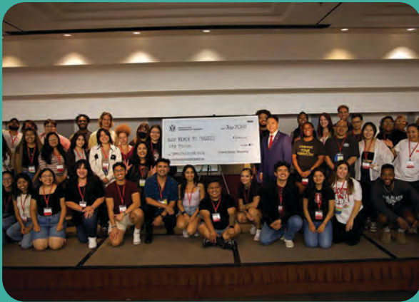
This year Camp Ready ended with a wonderful surprise. Thanks to funds secured by Congressman Ted Lieu and the Department of Education, Scholars going forward will receive a $5,000 annual basic needs scholarship.