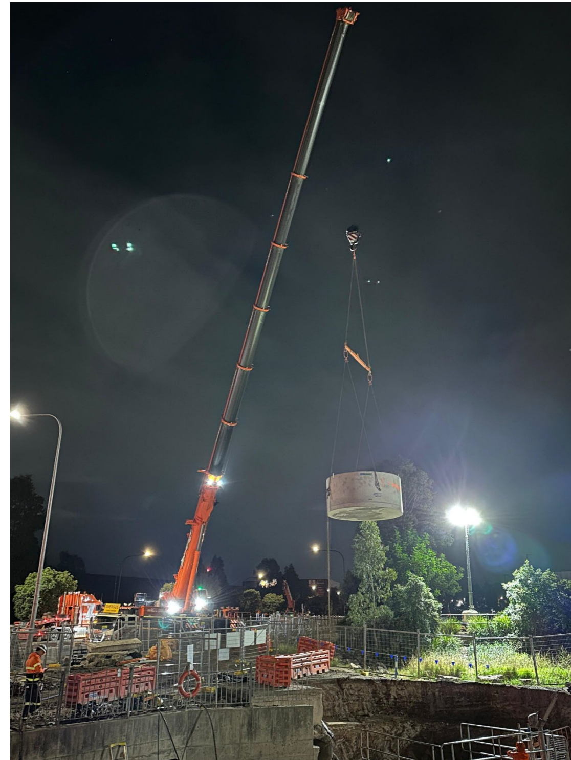
Hollinsworth – culvert precast installation in May