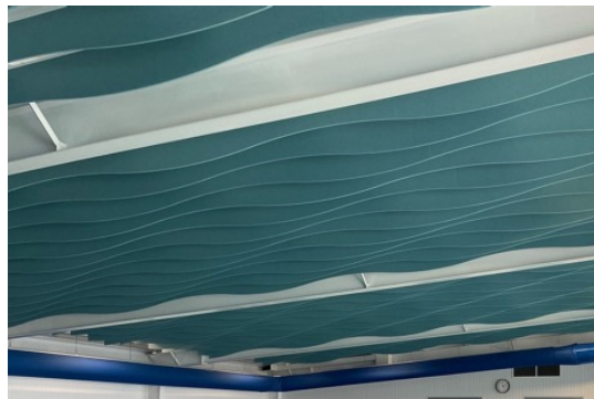
c. Frontier Talus in a humid space

Clients are advised to consult with their Autex Acoustics account manager during the design phase of a project involving humid spaces. Autex Acoustics have been involved with installations in high humidity environments for many years and in that time have gathered specific knowledge in addressing issues of condensation and mould growth. Our design team can create bespoke products that are unique to the conditions and requirements of each project.