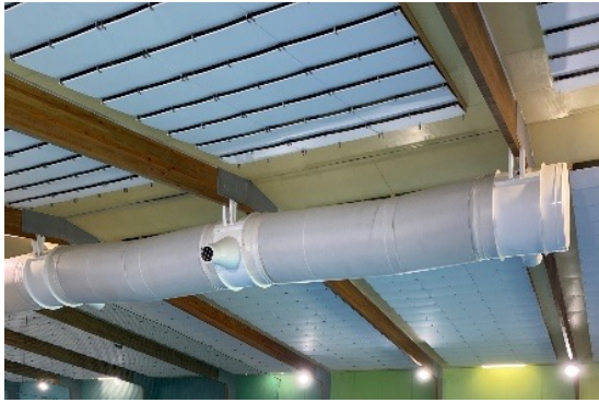
a. Bespoke louvre panel design allowing air flow in the roof cavity