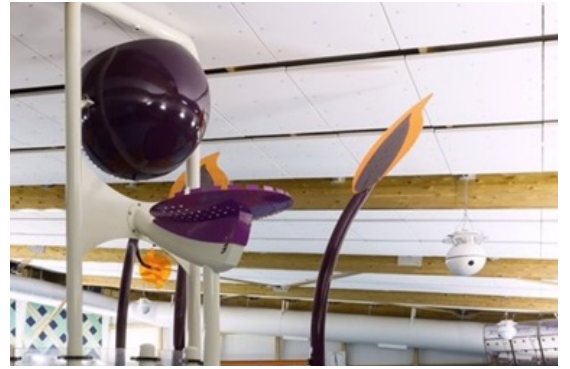
b. Quietspace® Panels with gaps to keep the roof cavity well-ventilated