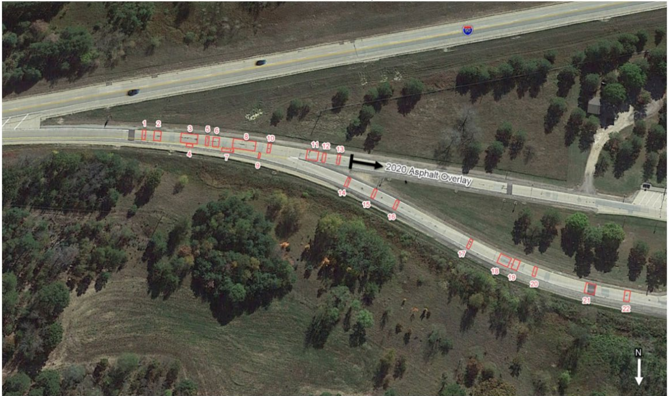
Concrete Pavement Repair Locations