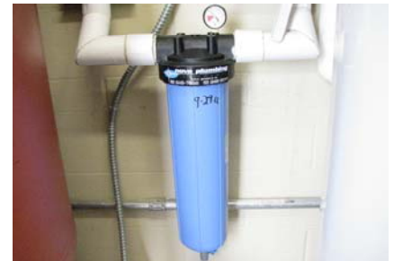
Water Filter at Madison SWEF