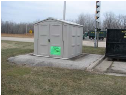
Sheds at Abrams SWEF 41 and Coloma SWEF 44