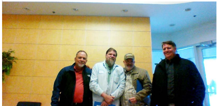
Handishop Industries, Inc. - 2016 WisDOT / RAM Conference

RFW RAM inspectors and the Operations Director communicate regularly with Program Managers and Site Managers to assure clear communications in establishing goals and producing outcomes expected by the traveling public and WisDOT. RFW RAM personnel converse on site with managers as well as by phone and e-mail. RFW RAM field and office team members are always ready to assist Service Providers in whatever way will assist them in a professional positive outcome for their staffs and sites.