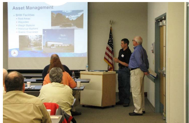
2016 WisDOT / RAM Conference

RFW continues to provide manuals, newsletters, product recommendation, training videos, program information and reports online for both RAM Service Providers and WisDOT. The content is continuously updated and is a centralized location for information and materials needed to assist field and administrative participants in maintaining their high standards of operation. RFW added a webpage with various financial and operational reports to allow WisDOT to obtain real-time data instead of waiting for reports to be updated.