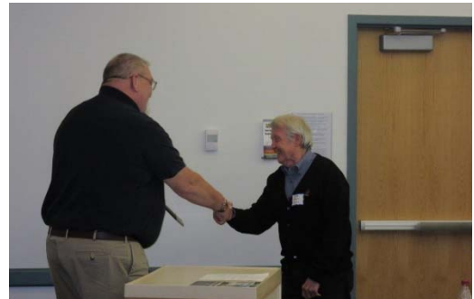
2016 WisDOT / RAM Conference

Twenty-two CRPs (Community Rehabilitation Programs) employed 375 persons with disabilities to provide care to the 30 year-round rest areas and 96 seasonal sites and park and rides. In a normal year, twenty-three CRPs would be involved in the RAM program, however, the Riverfront CRP did not provide RAM services in FY 2016 due to Rest Area #31 being rebuilt during this time.