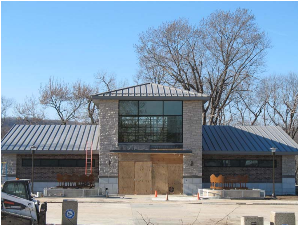
New Rest Area building in LaCrosse County