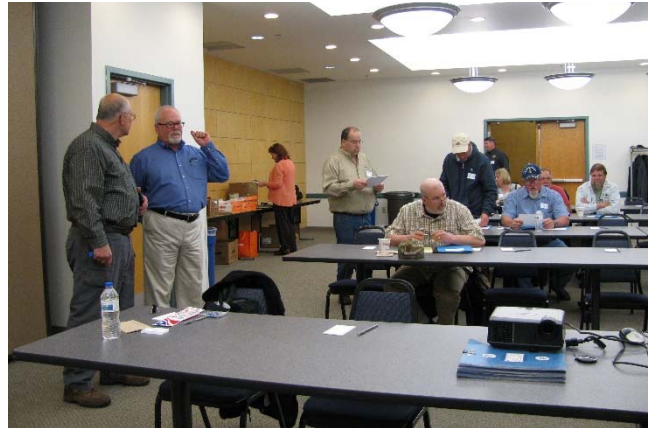
2016 WisDOT / RAM Conference

RFW prepared an annual Rest Area Traffic and Water Usage report for WisDOT in February 2016 which provides various reports showing traffic data and water usage for a twelve-month period (December 2014 – November 2015).