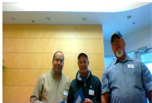
VIP Services, Inc. - 2016 WisDOT / RAM Conference

The construction of the new Rest Area #31 in La Crosse continued throughout FY 2016. Opening of the new facility is expected at the first of calendar year 2017. WisDOT and RFW have met several times with the RAM managers of Riverfront, Inc., service provider for RA #31 to keep them informed of construction progress and expected operational changes that will be required for the new facility. In April, 2016, WisDOT and RFW held a conference for all RAM site and program managers in Stevens Point. Asset management, ash tree removal and mitigation, recycling and truck parking were a few of the topics discussed.