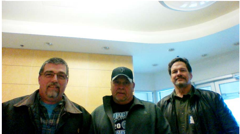
Superior Vocations Center - 2016 WisDOT / RAM Conference

Public Feedback: RFW obtains public feedback through the collection of comment cards and via electronic resources such as the RAM website. A total of 700 comments were received during FY 2016. Travelers from thirty-seven states and three countries visited Wisconsin rest areas. Approximately eighty-five percent of the comments were from travelers residing in the Midwest. Approximately two percent of the comments were from citizens of other countries including: Australia, Belgium, and Canada. The overall rating for FY 2016 is 1.15 based on a scale of 1 to 5, 1 being best.