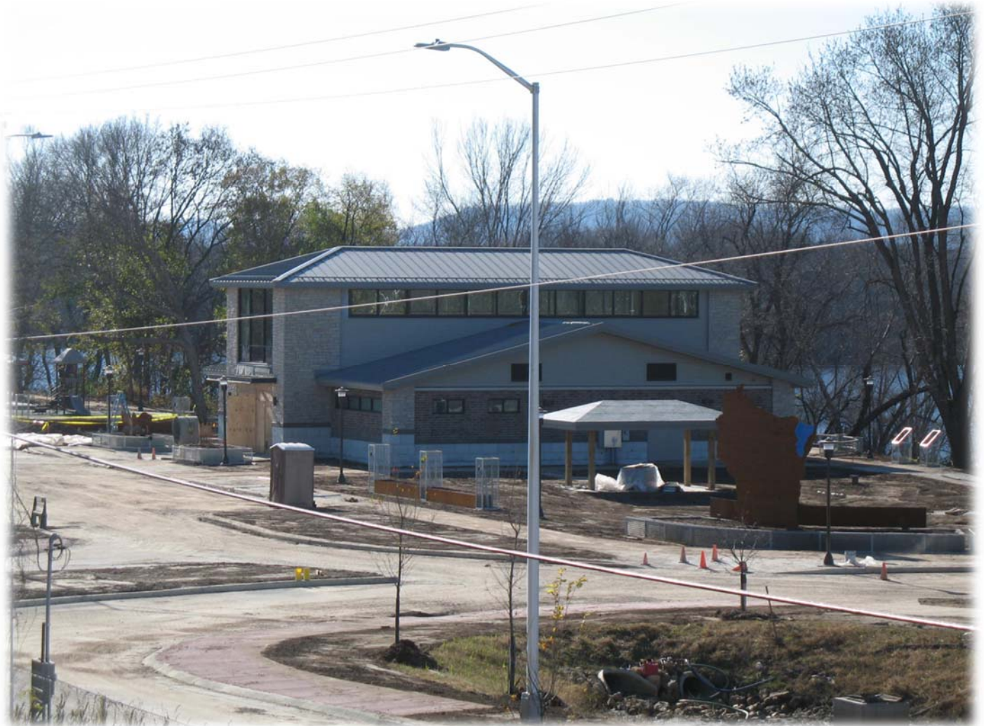
New Rest Area Building in LaCrosse County

Fiscal Year 2016 July 1, 2015 – June 30, 2016