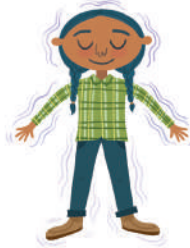
progressive muscle relaxation