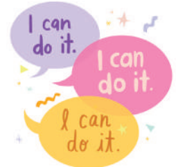
repeating a mantra