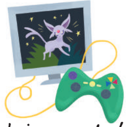
playing computer/ video games