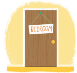
going to quiet space