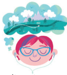
listening to guided imagery