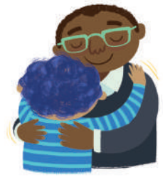
getting a hug