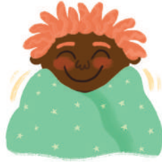
wrapping in a blanket