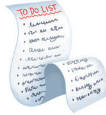
too much to do