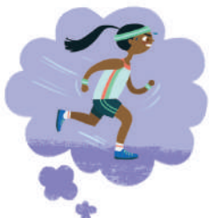
wanting to exercise