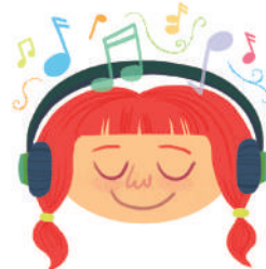
listening to music