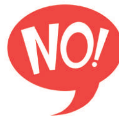
being told no