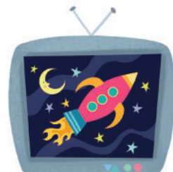
watching a show/movie