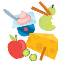
having a snack