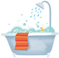
having a shower/bath