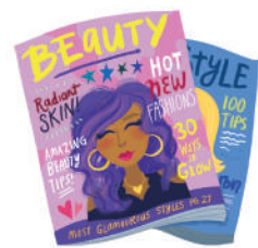
comparing myself to others