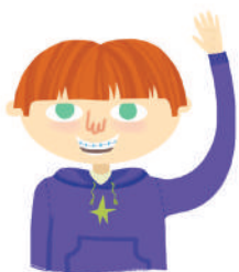
asking for help