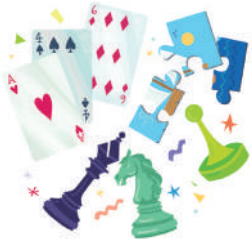
playing games/ doing a puzzle