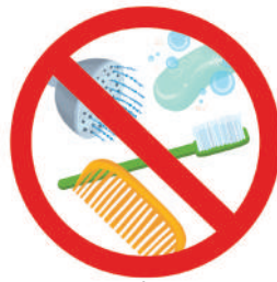
not taking care of myself