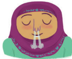
taking deep breaths