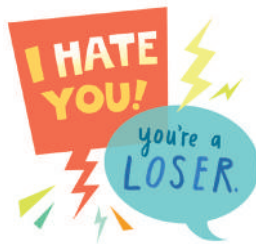
saying hurtful things