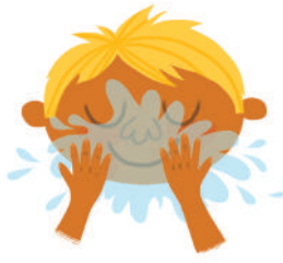
splashing water on face/wrists