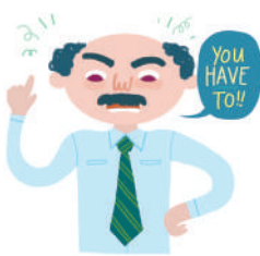
being told what to do