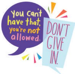
louder ED voice