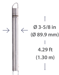
1. POWER SUPPLY