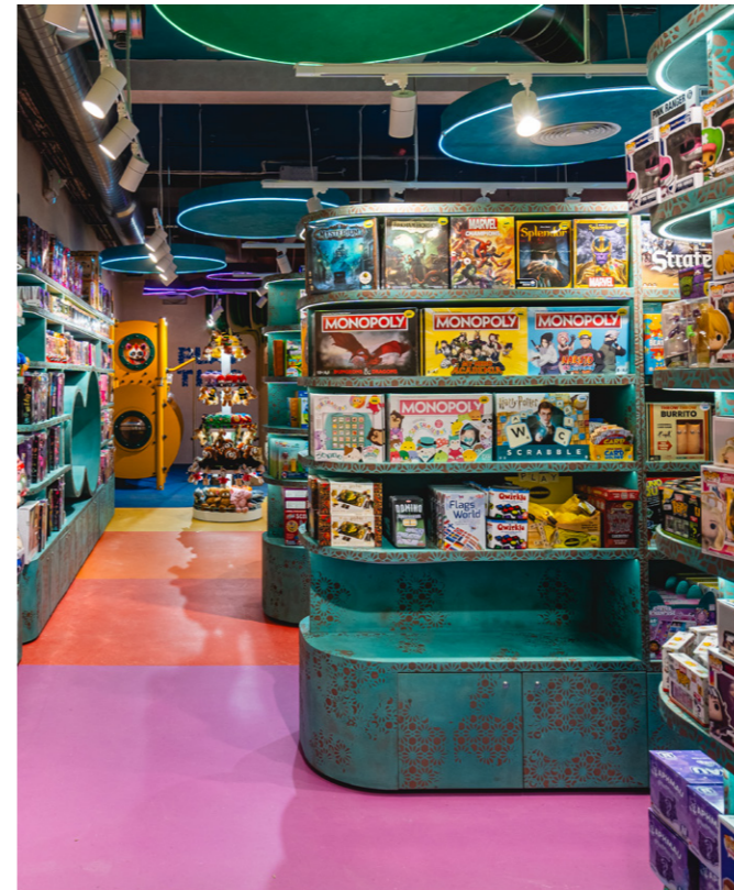
Project Location BOOGHE TOYS The Fort Shopping Centre, Birmingham