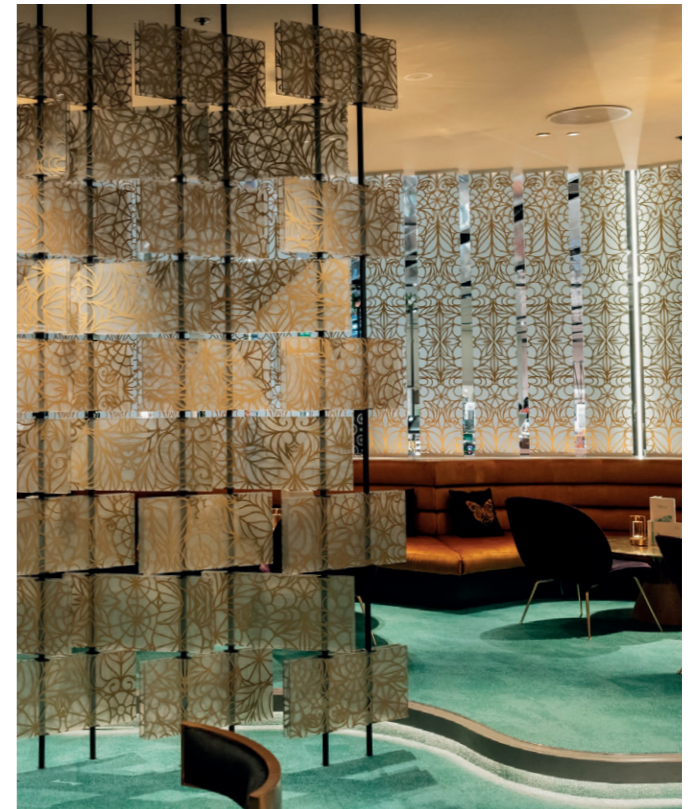
Project Location BAZAR Harvey Nichols, Birmingham