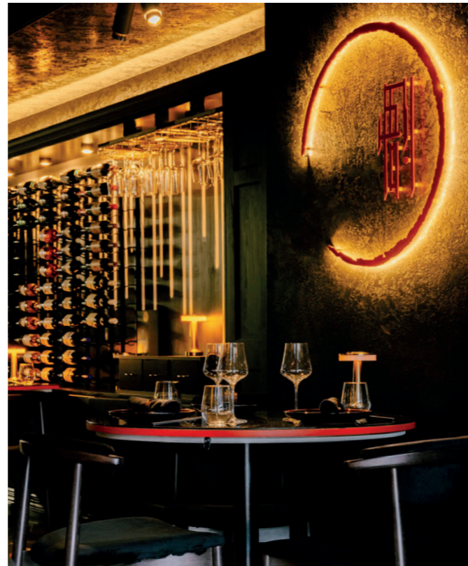
Project Location SATORI Moseley, Birmingham