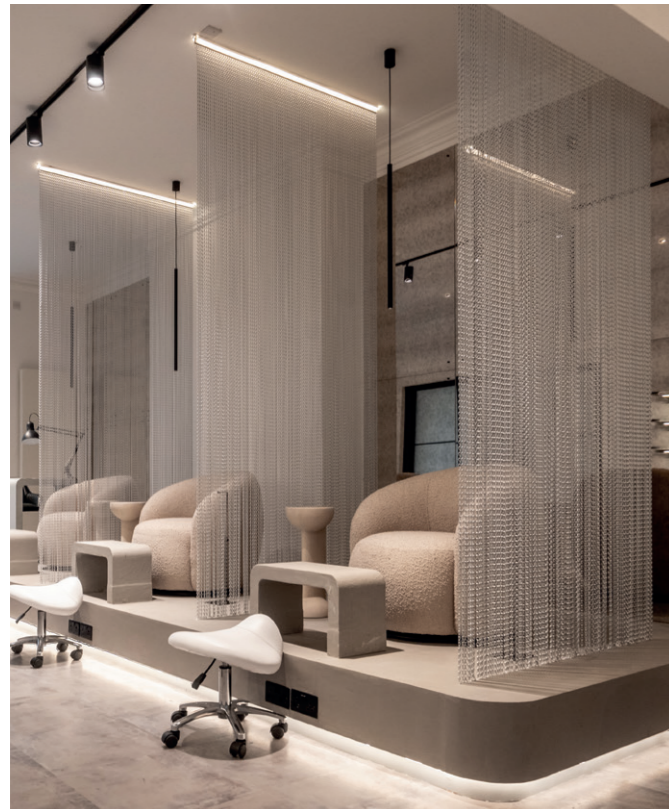
Project Location BEAUTY MADE Edgbaston, Birmingham

ATRIO PROJECTS / See our work on pages 24, 56, 58, 60 + pages 20 of issue 26