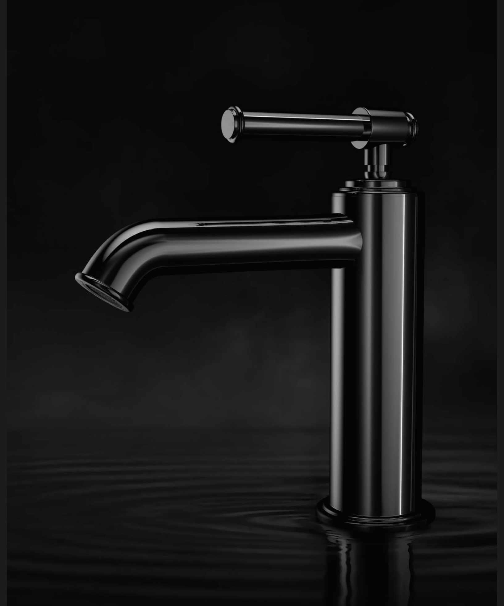
The design of the VIC collection is based on essential geometries - perfect circles and straight lines - but it's the detailing that transforms a modern shape into a sophisticated object.