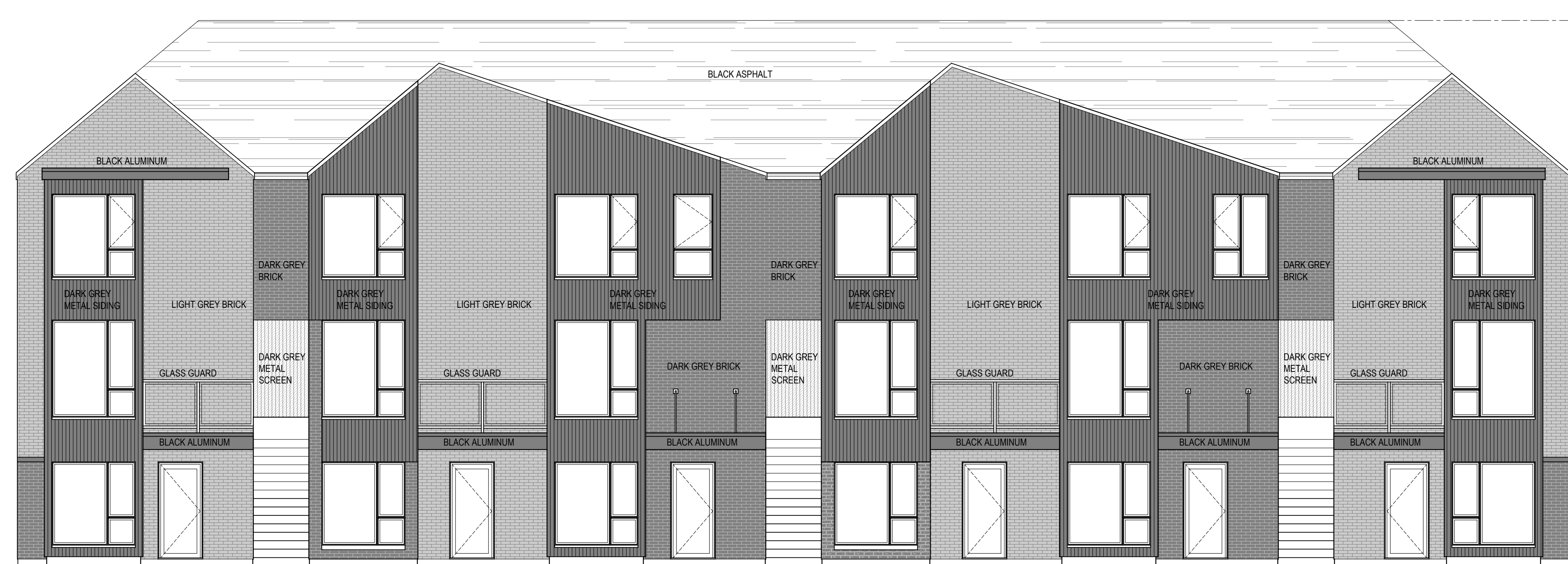
SOUTH ELEVATION (FACING RAIL)

GENERAL NOTES: 1. DRAWINGS ARE NOT TO BE SCALED. CONTRACTOR SHALL VERIFY ALL EXISTING CONDITIONS AND DIMENSIONS REQUIRED TO PERFORM THE WORK AND SHALL REPORT ANY DISCREPANCIES WITH THE CONTRACT DOCUMENTS TO THE ARCHITECT BEFORE COMMENCING WORK. 2. THE ARCHITECTURAL DRAWINGS ARE TO BE READ IN CONJUNCTION WITH ALL OTHER CONTRACT DOCUMENTS INCLUDING BUT NOT LIMITED TO PROJECT SPECIFICATIONS, STRUCTURAL, MECHANICAL AND ELECTRICAL DRAWINGS. 3. THE ARCHITECTURAL DRAWINGS AND PROJECT SPECIFICATIONS ARE THE PROPERTY OF THE ARCHITECT. 4. DIMENSIONS INDICATED ARE TAKEN BETWEEN THE FACES OF FINISHED SURFACES UNLESS OTHERWISE NOTED. 5. THE ARCHITECTURAL DRAWINGS ARE NOT TO BE USED FOR CONSTRUCTION UNLESS SPECIFICALLY NOTED FOR SUCH PURPOSE. THE CONTRACTOR WORKING FROM DRAWINGS NOT SPECIFICALLY NOTED FOR CONSTRUCTION MUST ASSUME FULL RESPONSIBILITY.