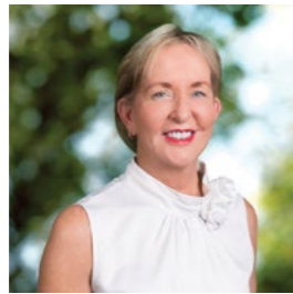
The Honourable Ros Bates MP Minister for Finance, Trade, Employment and Training

Queensland is open for business, open to new ideas, and open to the world.