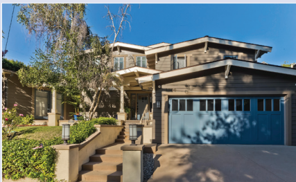
2700 Anchor Avenue - $2,995,000 4 Beds / 3 Bath, 3426 Sq. Ft.