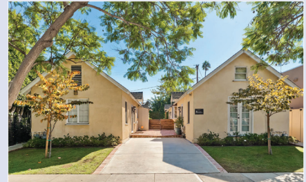
9028 Rangerly Ave - $1,750,000 4 Beds / 1 Bath, w/Laundry in Unit

This is an amazing opportunity to own a beautiful 4-plex in one of LA's most desirable neighborhoods within West Hollywood. Just a stone's throw from the shops and restaurants of Melrose and Doheny on a lush tree-lined street, each of the four spacious A-framed cottages has an abundance of charm and personality. Each unit offers: a large bedroom, hardwood floors, updated, artfully designed kitchen with stainless appliances, a remodeled bathroom with decorative tilework and large living room. The four units share a central brick courtyard, grassy front lawns under picturesque Jacaranda trees. Additional amenities include: in-unit washer and dryer, street parking, heating/air and a shared backyard/community garden. A fabulous chance to own a beautiful, income-bearing property in the heart of the city.