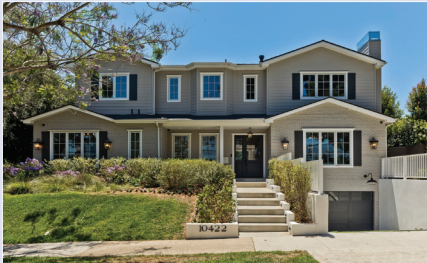
10422 Lorenzo - $7,995,000 6 Beds / 8 Bath