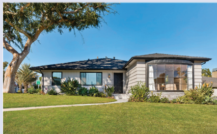
9125 David Ave - $2,795,000 4 Beds / 3 Bath, 2392 Sq. Ft., 7674 Sq. Ft. Lot