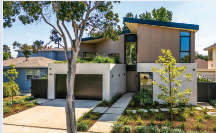
2831 Malcolm Avenue - $3,795,000 4 Beds / 5 Bath, 3450 Sq. Ft., 6324 Sq. Ft. Lot