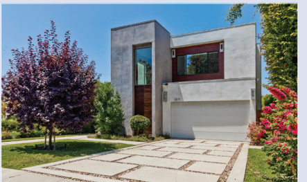
3571 Colonial Avenue - $3,995,000 5 Beds / 7 Bath, 4225 Sq. Ft., 7500 Sq. Ft. Lot