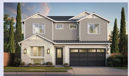
2803 Cardiff Avenue - $4,815,000 5 Beds / 6 Bath, 4382 Sq. Ft., 6763 Sq. Ft. Lot