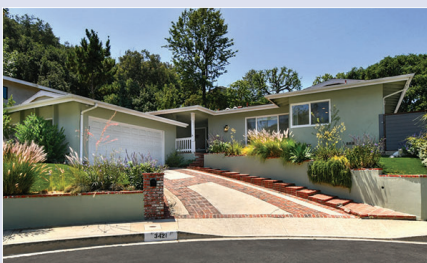
3421 Castlewoods Place - $2,195,000 4 Beds / 3 Bath, 2815 Sq. Ft.