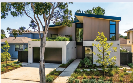
2831 Malcolm Avenue - $3,795,000 4 Beds / 5 Bath, 3450 Sq. Ft., 6324 Sq. Ft. Lot