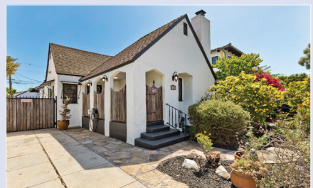
9120 Gibson Street - $1,595,000 3 Beds / 2 Bath, 1275 Sq. Ft.