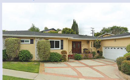
9600 Beverlywood Street - $2,830,000 4 Beds / 4 Bath, 2926 Sq. Ft.