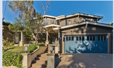
2700 Anchor Avenue - $3,295,000 4 Beds / 3 Bath, 3426 Sq. Ft.

A stunning Craftsman style home on one of the loveliest streets in all of Cheviot Hills, this 4 bedroom/3 bath house on Anchor has so much to offer. There is beauty around every corner of this 3,426 sq ft property. High vaulted ceilings, hardwood floors, open floor plan. There is a formal Dining Room, Living room and cozy breakfast nook that opens to the private backyard, surrounded by greenery. Sliding glass doors allow for maximum natural light to stream in and provides pleasant views of the backyard pool and landscaping.