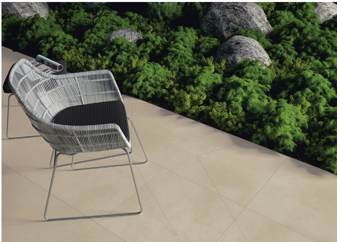
Genova Porcelain Tiles