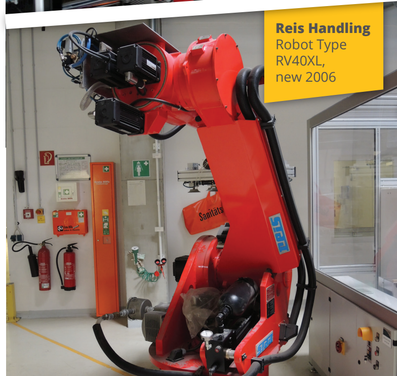
Reis Handling Robot Type RV40XL, new 2006