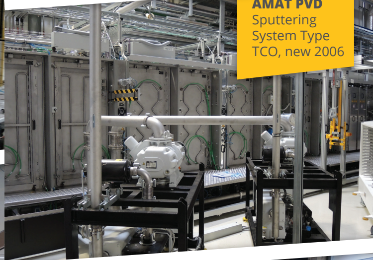
AMAT PVD Sputtering System Type TCO, new 2006