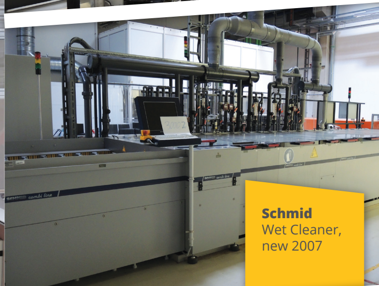
Schmid Wet Cleaner, new 2007