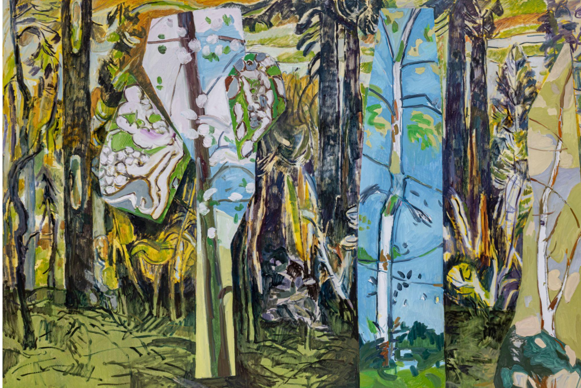
Rebound , 2022-23, 48 x 60 inches, oil on canvas