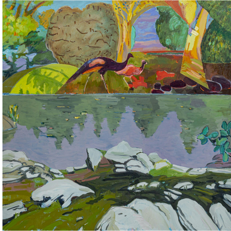
Softest of Mornings , 2022-23. 51 x 51 inches, oil on canvas.