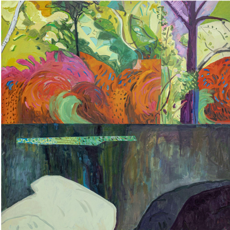
On a Rock Near a Dark Lake , 2022-23, 46 x 46 inches, oil on canvas