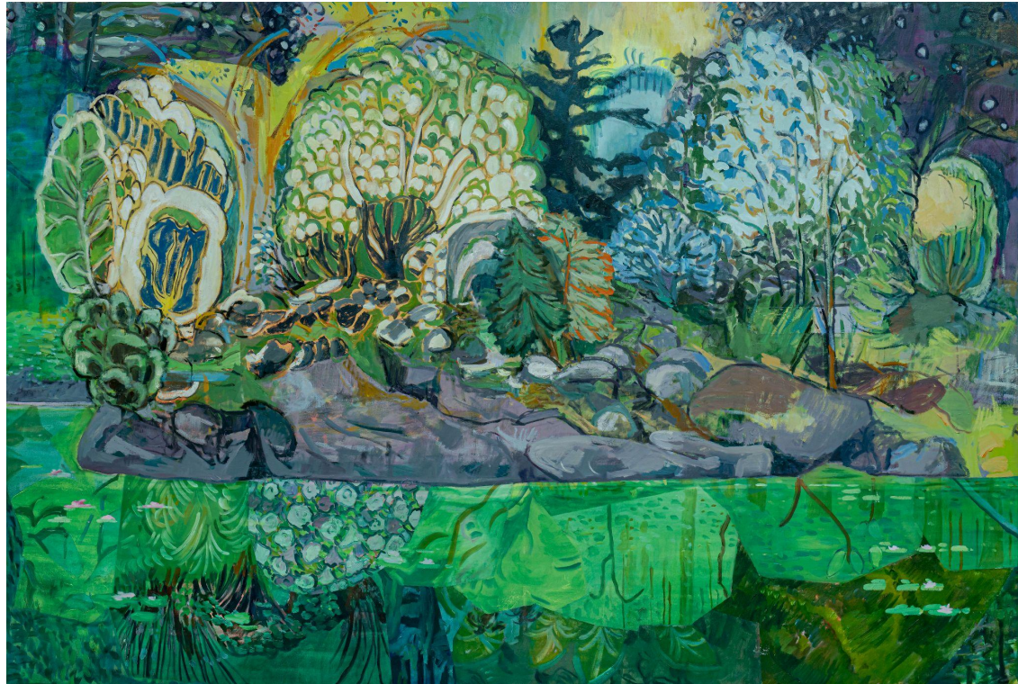
Mystic River , 2023. 50 x 80 inches. oil on canvas