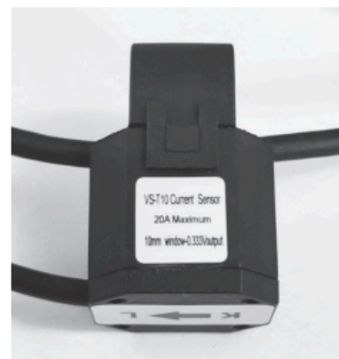
Figure 2: Fitting of current transformer