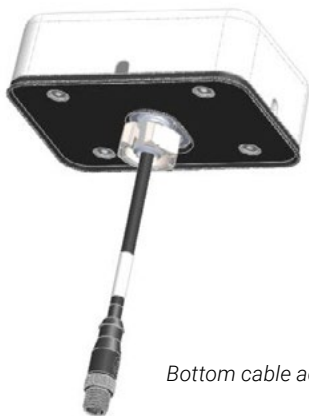
Bottom cable access