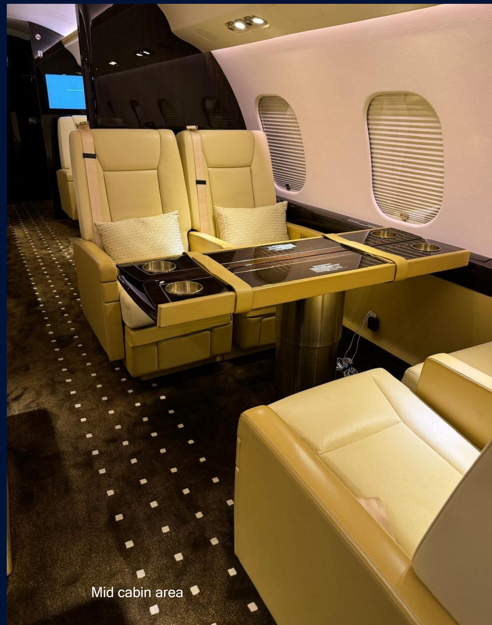
Mid cabin area