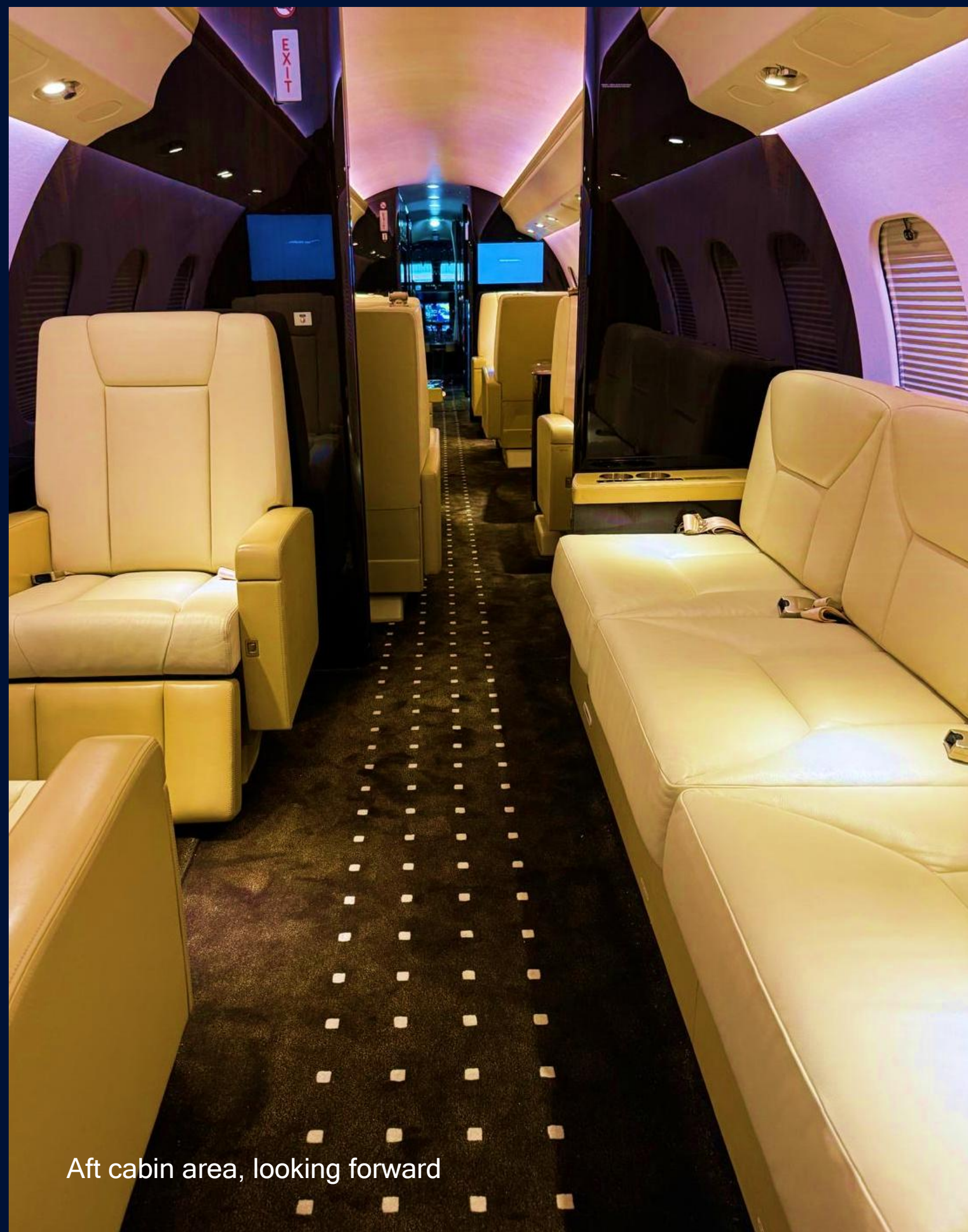
Aft cabin area, looking forward