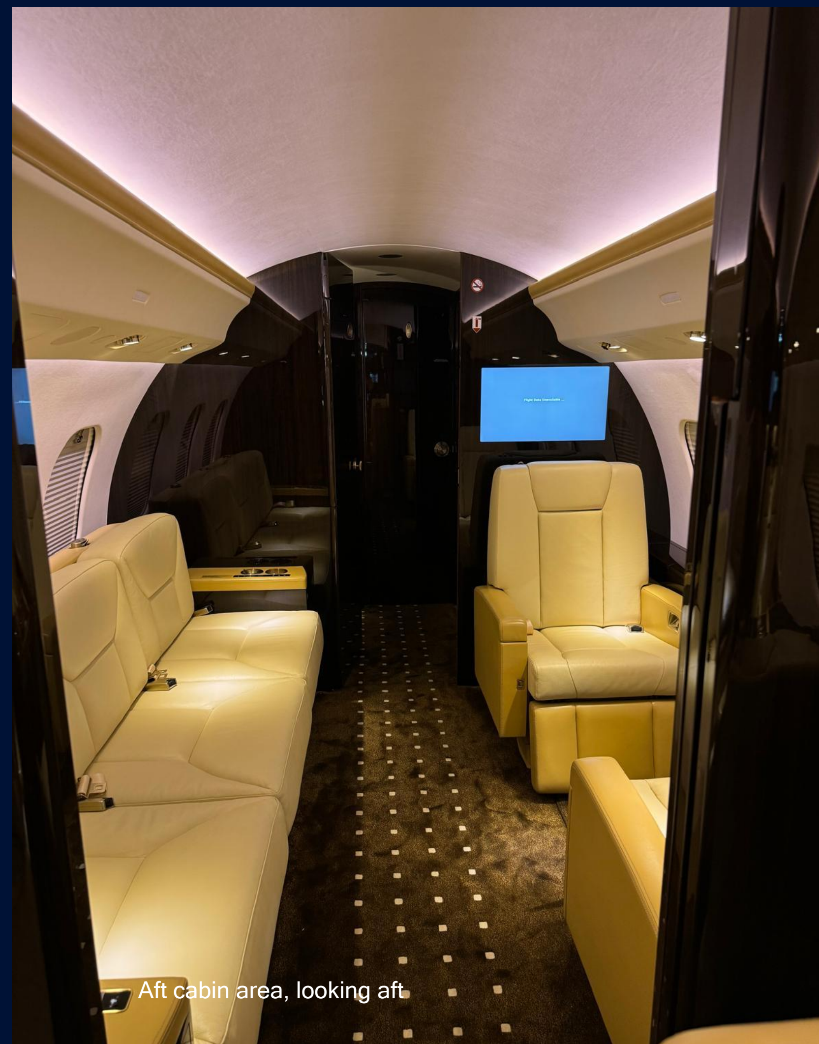
Aft cabin area, looking aft