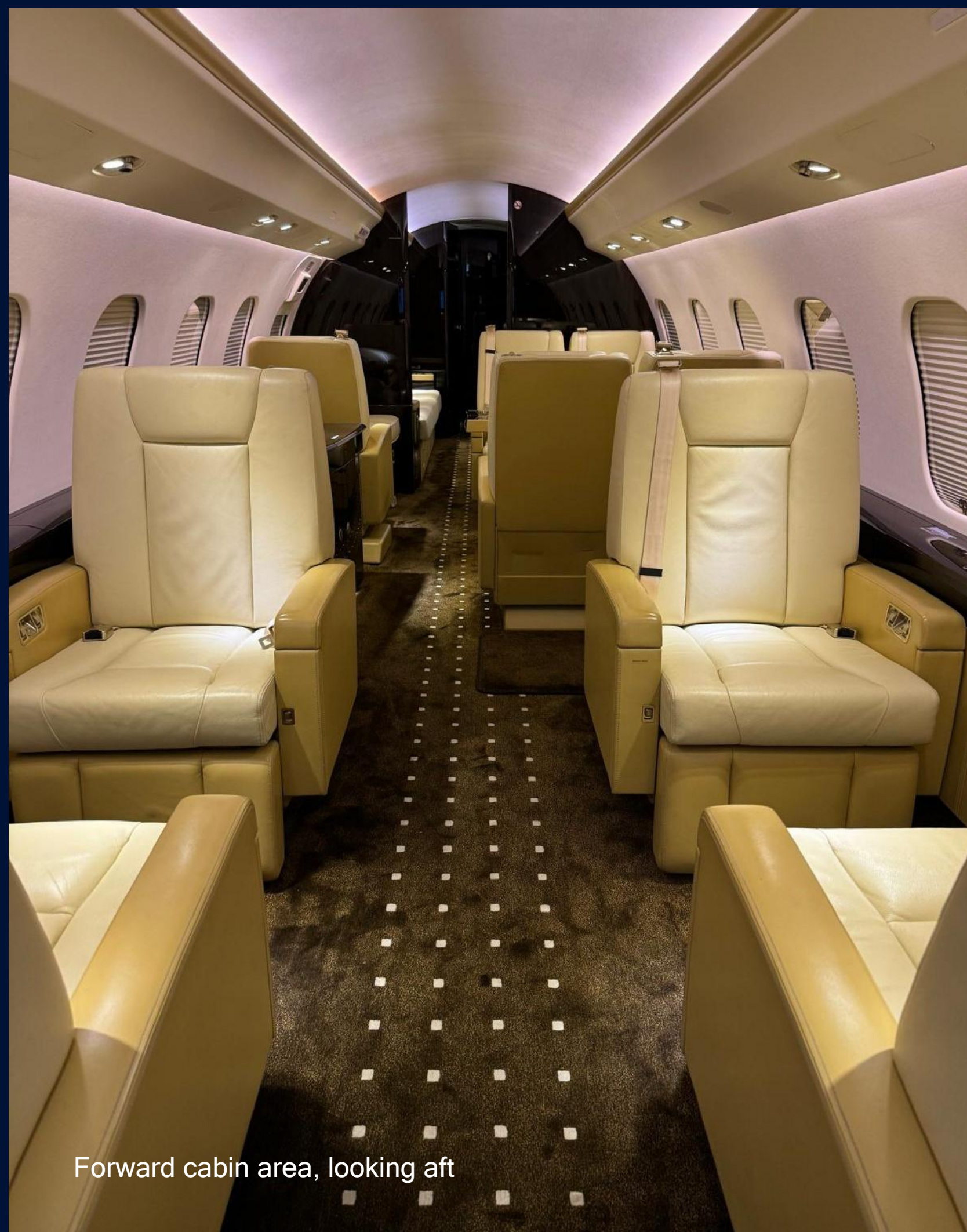
Forward cabin area, looking aft