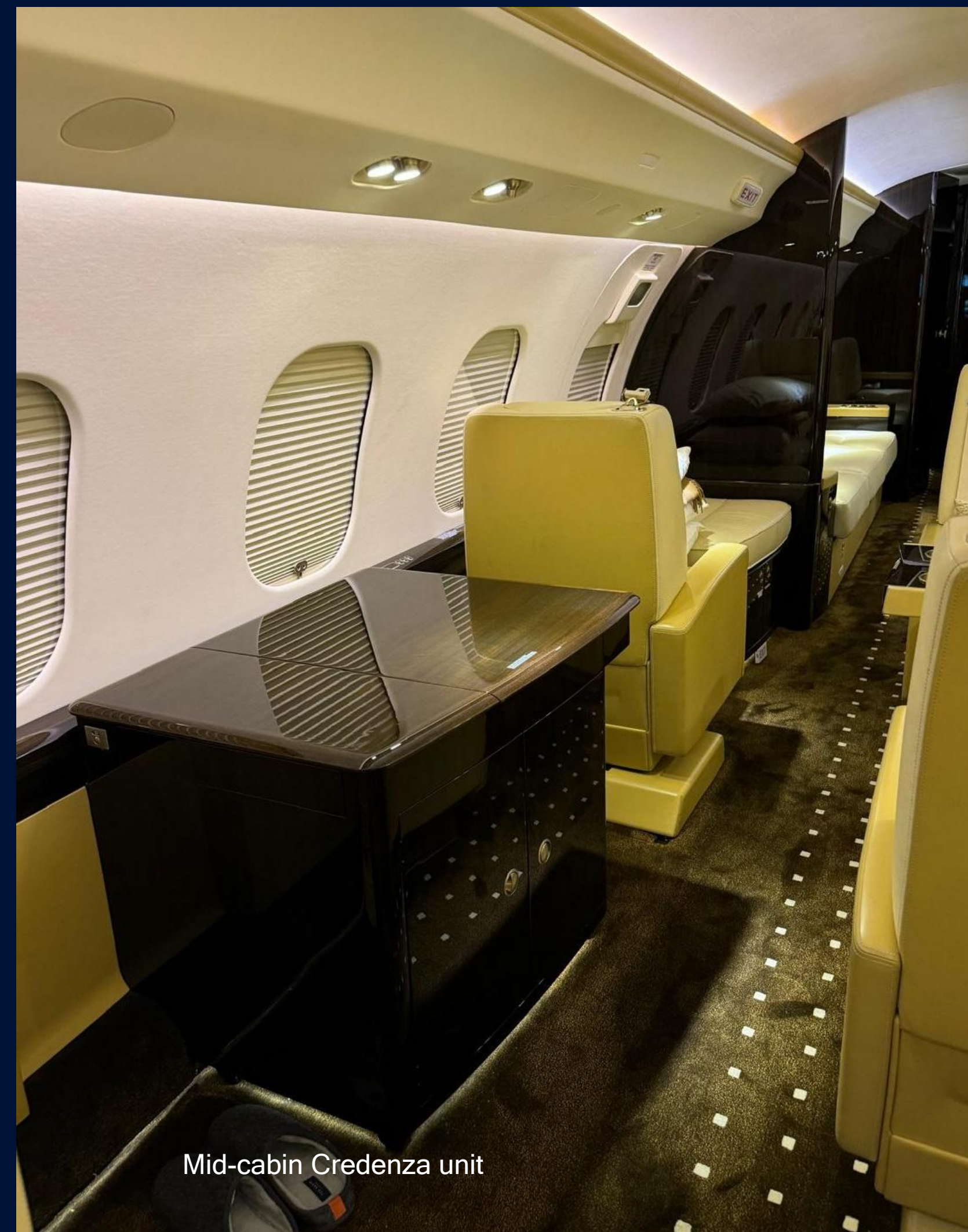
Mid-cabin Credenza unit