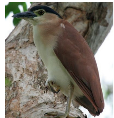
Nankeen Night Heron