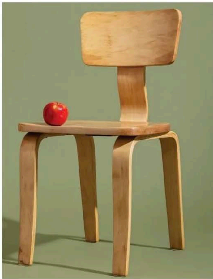
A chair from Portland-based furniture and home goods brand Meyette.