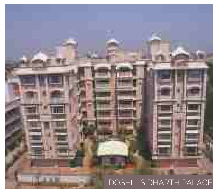
DOSHI - SIDHARTH PALACE