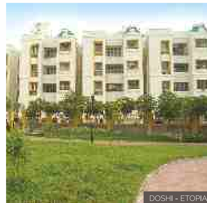
DOSHI - ETOPIA