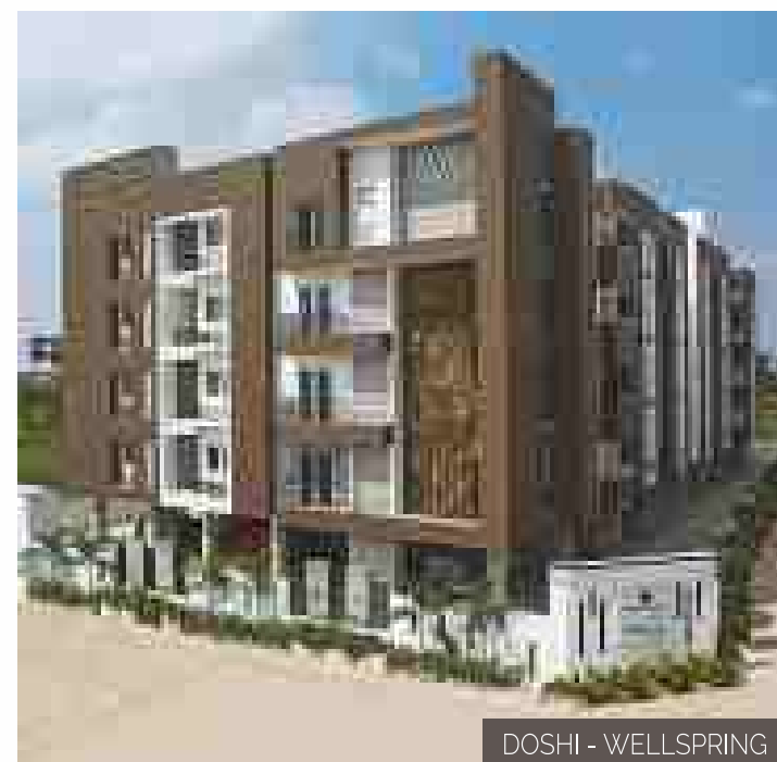
DOSHI - WELLSPRING