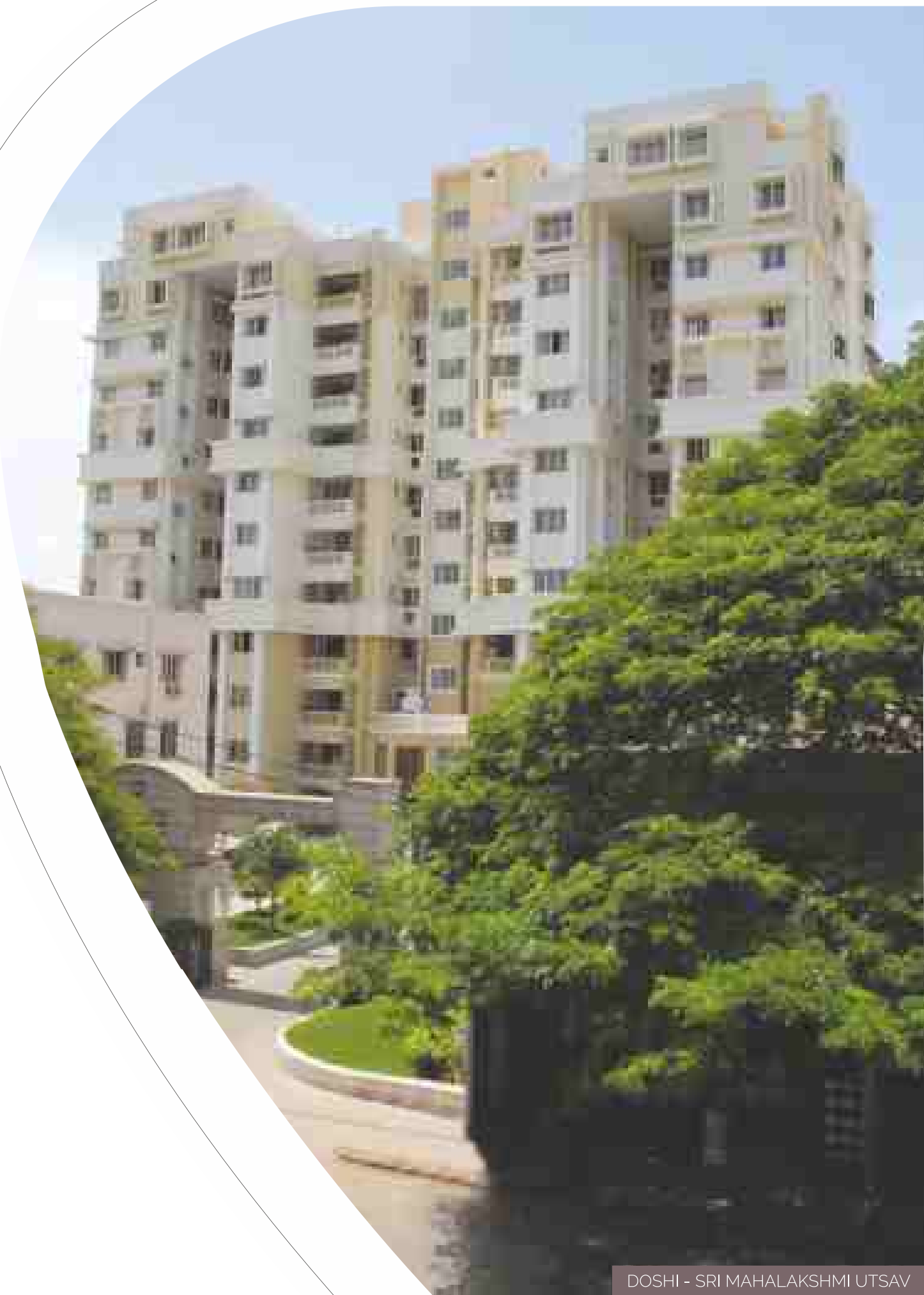
DOSHI - SRI MAHALAKSHMI UTSAV