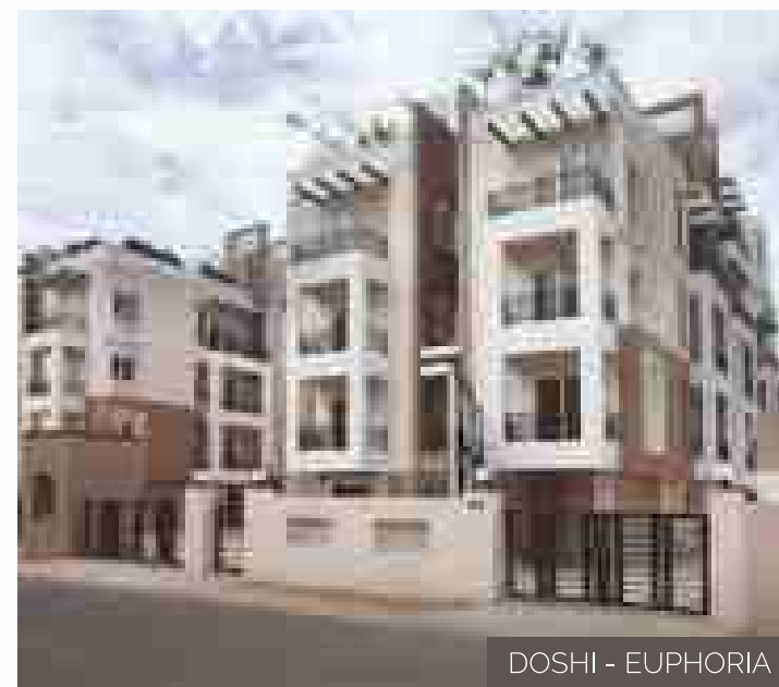
DOSHI - EUPHORIA