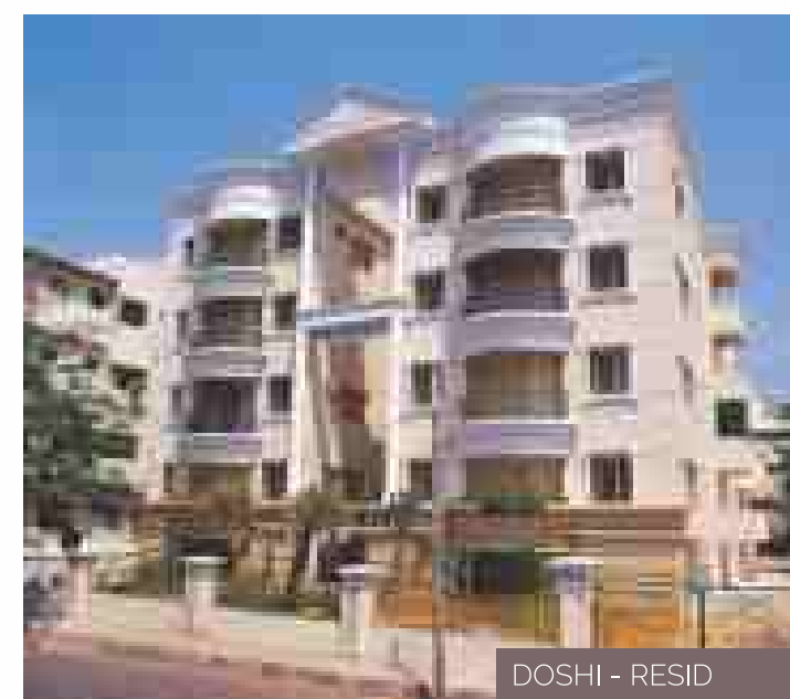
DOSHI - RESID