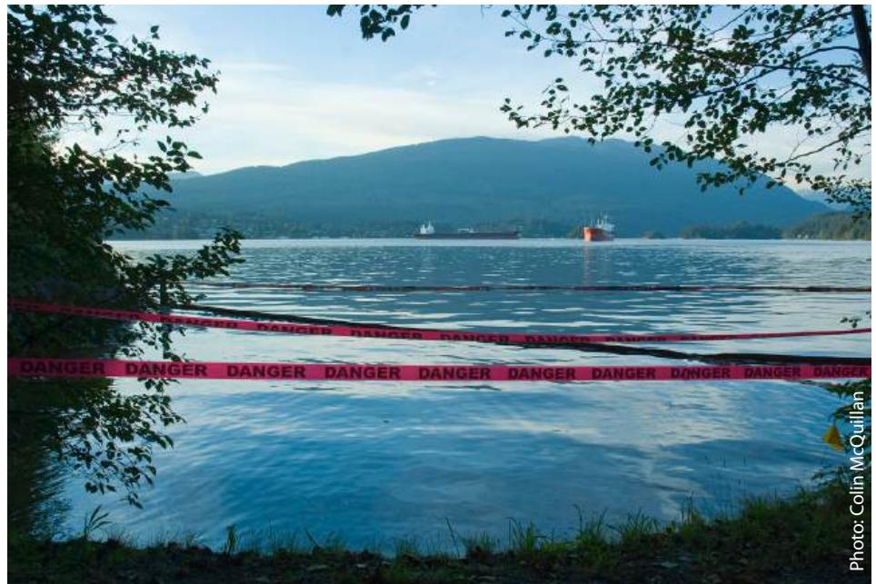
Scene from a past oil spill in Burrard Inlet.