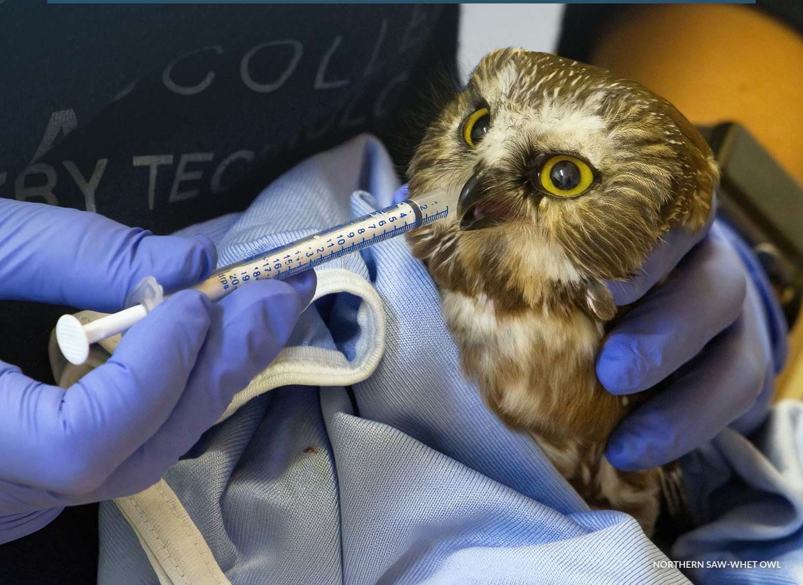
NORTHERN SAW-WHET OWL

Your support has a direct impact: It's because of corporate generosity, we are able to provide wildlife with a second chance at life.