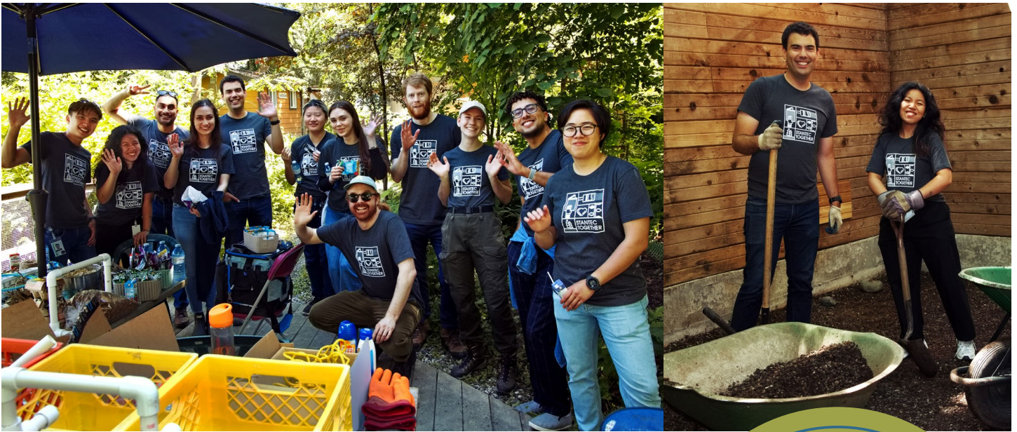
TEAM PARTICIPATING IN A CORPORATE DAY OF VOLUNTEERING