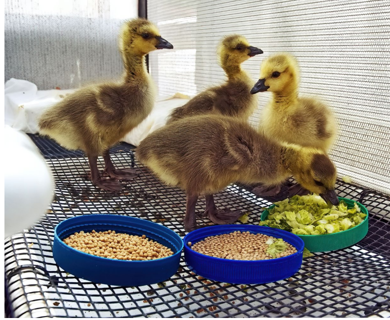
CANADA GOOSE GOSLINGS

Through the generous support of our community partners and sponsors, we run several inter-connected programs to deliver on our mission. These include a unique Rescue-Transport-Release program, education and outreach, foster family placements, conservation initiatives and a Wildlife Support Centre that is open to the public year-round.