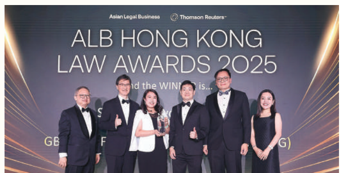
SFKS is the winner of "GBA Law Firm of the Year (Hong Kong)" in the Asian Legal Business Hong Kong Law Awards 2025.