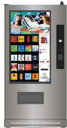
Top banner ads