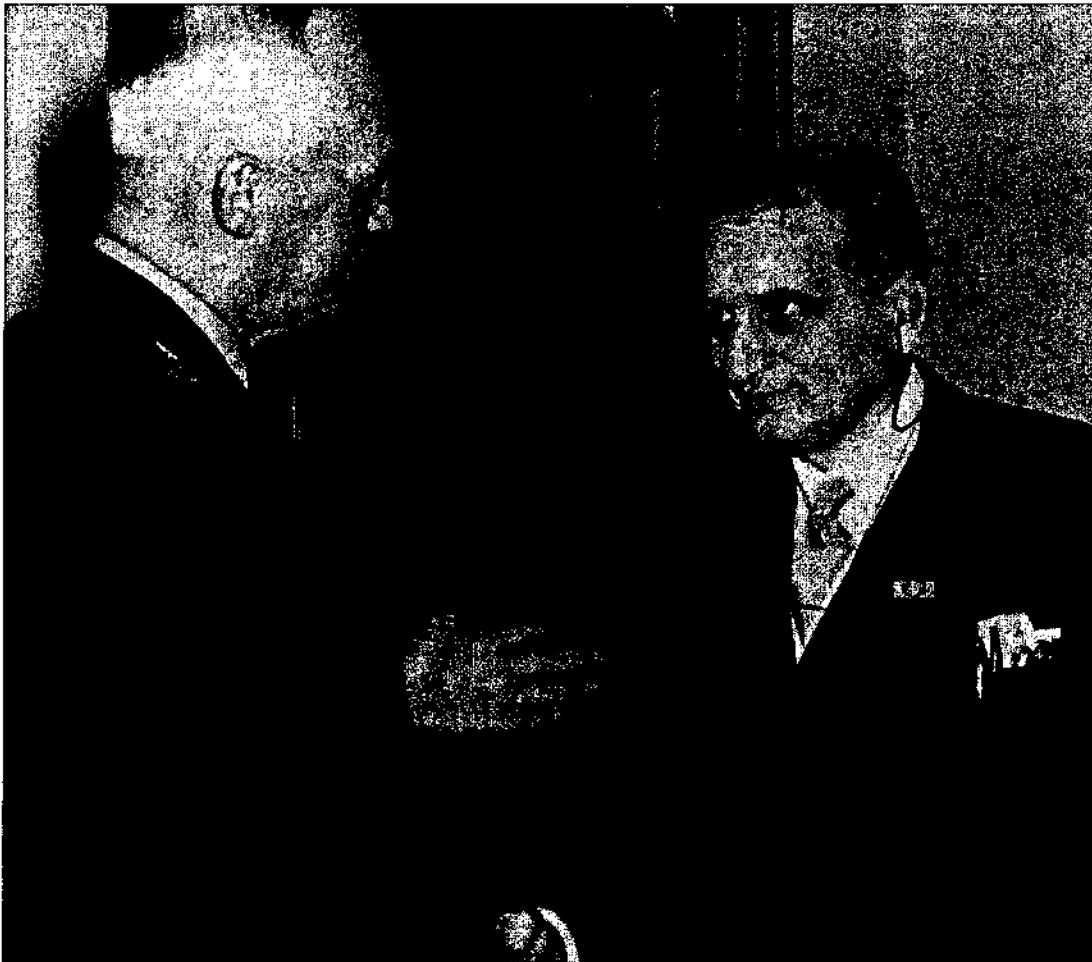
Figure 1. Five Star General Hap Arnold thanks Dr. Theodore von Kármán following the completion of the first Airpower S&T report. The report, Toward New Horizons , was submitted on 15 December 1945.